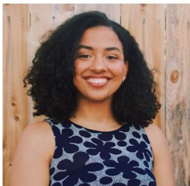
Tyra Popovich Museum, Public Affairs Pitzer College Major: Organizational Studies

“I’ve always been interested in art publication, whether it be informal hand-made zines or more formal art books. I’m looking forward to learning more about the print production process and meeting all the talented individuals in the publications department.”