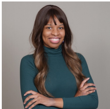
Candace Brown Foundation, Grants Programming California State Polytechnic University, Pomona Major: Philosophy

“I most look forward to advancing my understanding of art conservation and preservation. I hope that expanding my independent research and communicative skills through a remote internship is beneficial for my career in the field.”