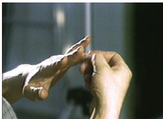
Yamaguchi Yoshiomi, Shintai o, aruiwa shintai ni kiku/Listen the Body , 1986, color video. © Yamaguchi Yoshiomi