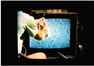
Visual Brains, Rec Zone , 1986, color video. © Visual Brains