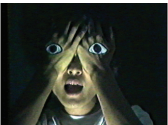
Sakurai Hiroya, SAKASA (The Inversion) , 1981, color video. © Sakurai Hiroya