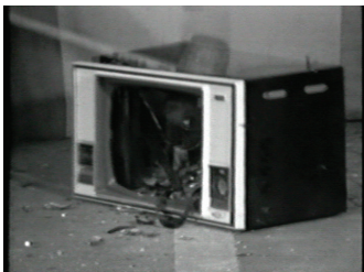
Kawaguchi Tatsuo, Muraoka Saburō, and Uematsu Keiji, Eizōno eizō-Miru koto/Image of Image-Seeing , 1973, b/w video. © Kawaguchi Tatsuo, Muraoka Saburō, Uematsu Keiji