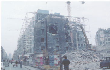
Conical Intersect , 1975

Bingo documents the ten-day progression of Matta-Clark's incision into a Niagara Fall's residence before its demolition. Using a system derived from techniques developed by the British architect and theorist Colin Rowe, Matta-Clark first divided the exterior wall of the house into nine equal grid-like sections. He then removed eight segments from the structure piece by piece, leaving the middle section of the grid intact. Bingo was filmed and edited primarily by Matta-Clark.