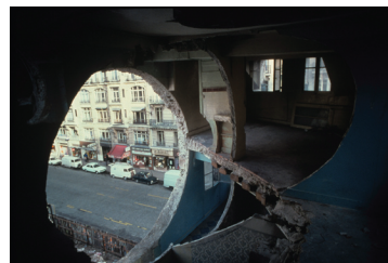
Conical Intersect , 1975

For City Slivers , which was made with a camera borrowed from Robert Rauschenberg, Matta-Clark affixed vertical matte strips in front of an anamorphic camera lens, thereby allowing only slivers of light to penetrate the film. He then rewound the film, repositioned the mattes, and reshot the same camera load. Using only in-camera editing, the light appears to slice through the film frame in a manner analogous to Matta-Clark's architectural "cuttings."