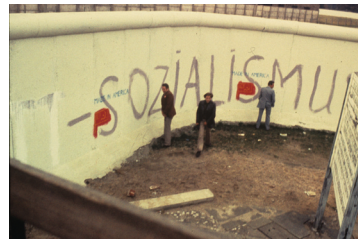
Made in America , 1976

Tonight's presentation of Conical Intersect features newly edited sound and subtitles.