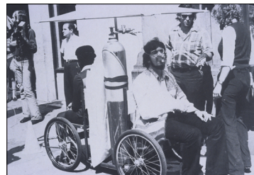
Fresh Air Cart , 1972