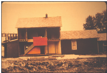
Bingo , 1974

Bingo , Gordon Matta-Clark, 1974, Super 8, color, silent, 9 min. 40 sec.