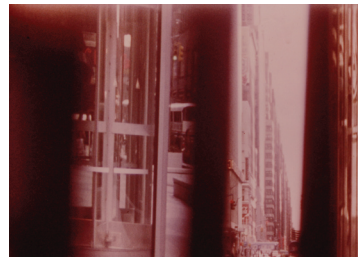
City Slivers , 1976

City Slivers , Gordon Matta-Clark, 1976, 16 mm, color, silent, 15 min.