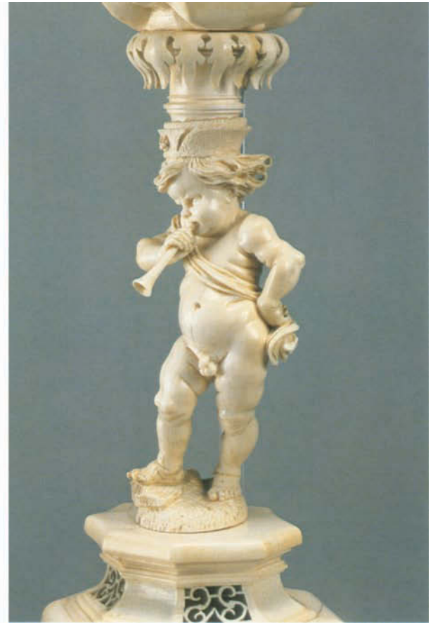
18 MARCUS HEIDEN German (Coburg), active by 1618–after 1664 Standing Covered Cup , 1631

Lathe-turned and carved ivory 63.5 cm (25 in.)