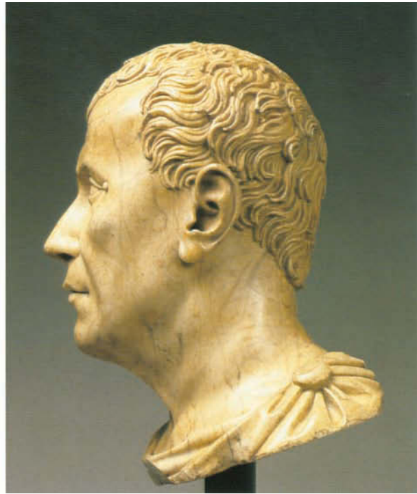
2 CONRAT MEIT German (active in France, Brabant, Mechelen, and Antwerp), 1480s?–1550/51 Head of a Man (possibly a portrait of Cicero), circa 1520 Alabaster 33 cm (13 in.) 96.SA.2

Born in Worms, Meit was in Wittenberg by 1511, working for the Saxon elector Friedrich the Wise, who also employed Albrecht Dürer and Lucas Cranach the Elder. Around 1512 the sculptor moved permanently from Germany, and in 1514 he became official court sculptor to Margaret of Austria (1480–1530), regent of the Netherlands, in Mechelen. In 1526, Meit began work on his first monumental undertaking, the tombs of Margaret, Philibert, and Philibert’s mother, Margaret of Burgundy, in the Church of Saint Nicolas de Tolentin in Brou. These tombs, together with a signed alabaster statuette of Judith , provide a secure foundation for the assessment of Meit’s style and the attribution of works to him.