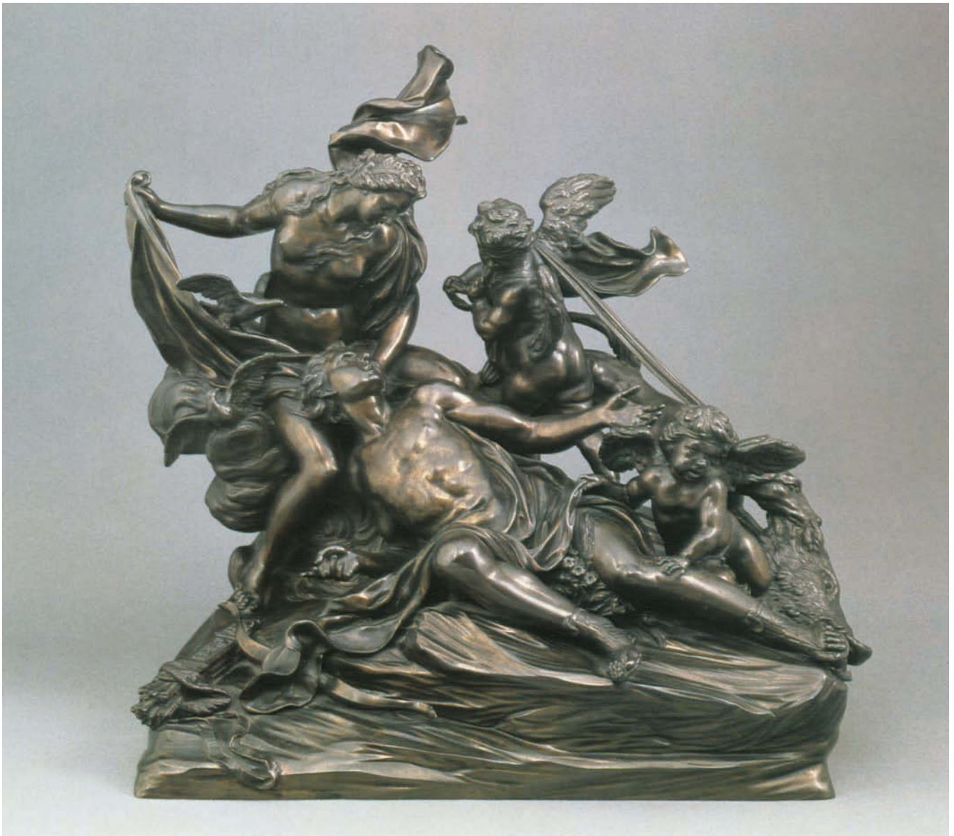
29 MASSIMILIANO SOLDANI BENZI, called Soldani Italian (Florence), 1656–1740 Venus and Adonis , circa 1715–1716