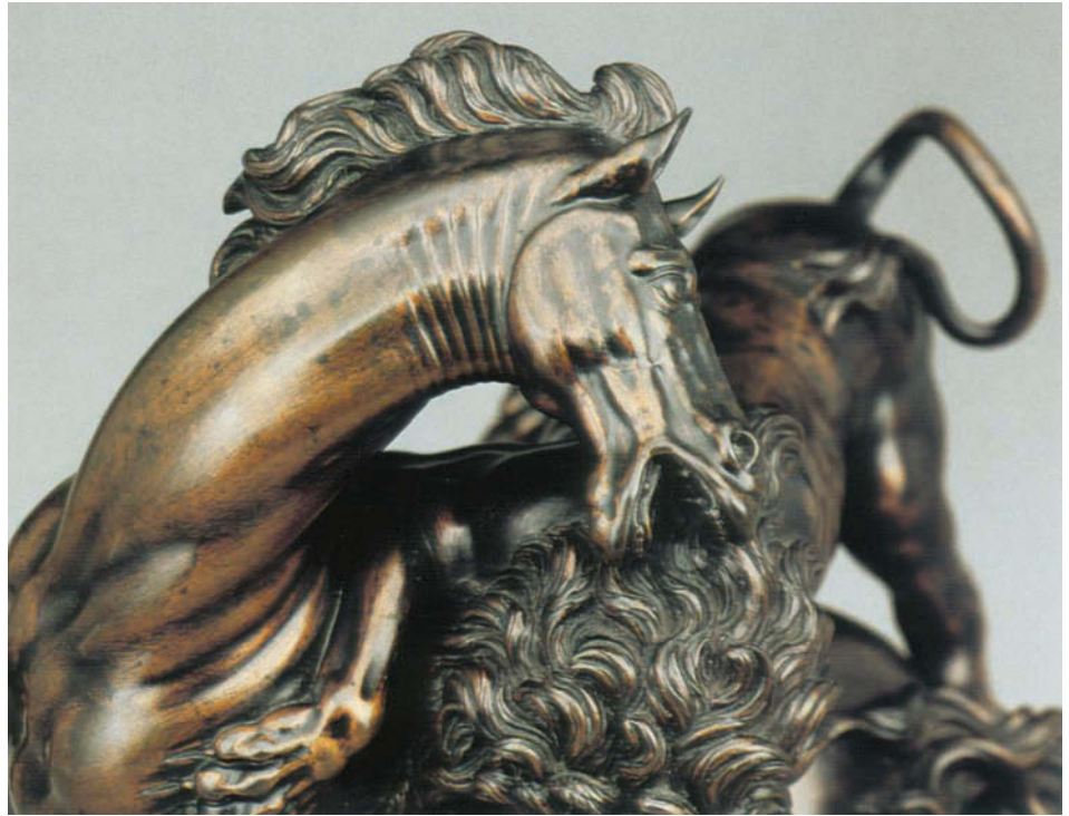
13 ANTONIO SUSINI Italian (Florence), active 1572–1624 or GIOVANNI FRANCESCO SUSINI Italian (Florence), circa 1585–circa 1653 After a model by Giovanni Bologna (Jean Boulogne), called Giambologna Italo-Flemish (born Douai, active in Florence), 1529–1608 Lion Attacking a Horse , first quarter of the seventeenth century Bronze 24.1 x 28 cm (9½ x 11 in.) 94.SB.11.1