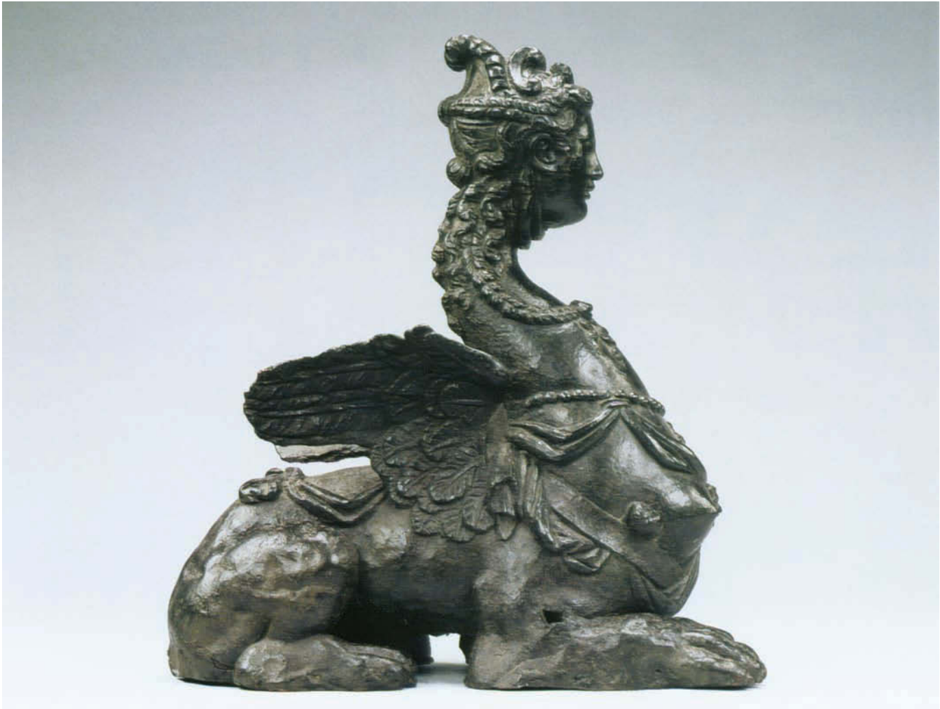
7 Sphinx Italian (Florence), circa 1560 Bronze 64 cm (25 3 / 16 in.) 85.SB.418.1

The sphinx is a creature of fable, composed of a woman's head and chest, a lion's body, and an eagle's wings. She is depicted crouching on all fours, with heavy-lidded eyes and her head pulled back—like a snake about to strike—over a long, bejeweled, curving neck that leads down to large projecting breasts proffered to an unsuspecting victim. The overall impression conveyed is of a cool, threatening sensuality. Her exotic allure, combined with the elaborate coiffure, sinuous forms, and fantastic imagery, is typical of much Florentine Mannerist art and finds close sculptural parallels in the work of Benvenuto Cellini and Vincenzo Danti.