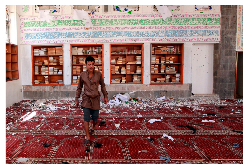
Figure 13.9 A Yemeni man inspects the damage following a bomb explosion at the Badr mosque in southern Sana'a on 20 March 2015.