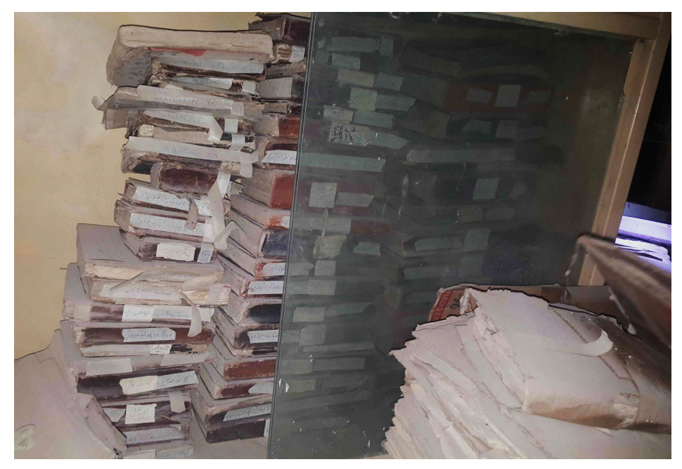
Figure 13.8 Stack of manuscripts in a private library in Yemen, 2019.