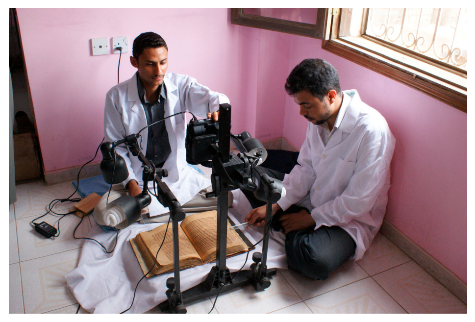
Figure 13.7 Personnel of the Imam Zayd b. Ali Cultural Foundation, Ṣanʿāʾ, digitizing manuscripts, 2009.

At the same time, there are several factors that put the library tradition of Yemen at immediate risk today. As elsewhere, books are a commodity in Yemen, and the buying and selling of books and the dispersal of entire libraries following the demise of their owners are common occurrences. Moreover, manuscript culture has persisted in Yemen beyond the turn of the twenty-first century, as is evident from the fact that manuscripts are still being produced in large numbers. As a result, there are interesting encounters between manuscript tradition and technology. Once photocopy machines became available in Yemen, owners of manuscript libraries began to produce copies of individual codices from their collections and often had them bound in the traditional manner. These mechanically produced "new" codices became a novel commodity alongside codices produced by hand, and the same applies to compact discs and other digital media containing scans of large numbers of manuscripts, and often entire libraries, with poor or no documentation as to the provenance of the material and the whereabouts of the physical codices (fig. 13.8).<sup>19</sup>