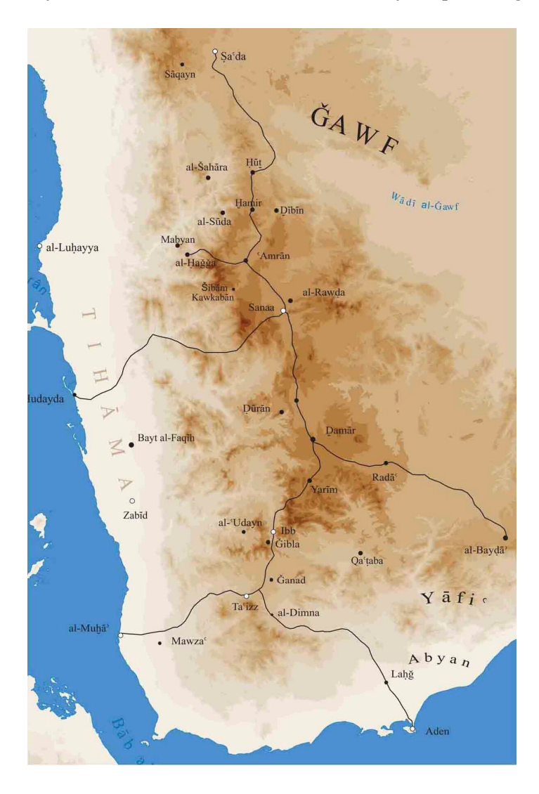
Figure 13.5 Map of Yemen during the seventeenth century, in Tomislav Klarić, "Untersuchungen zur politischen Geschichte der qāsimidischen Dynastie [11./17. Jh.]," PhD diss., University of Göttingen, 2007, fig. 4. View map at www.getty .edu/publications/cultural -heritage-mass-atrocities/part -2/13-schmidtke/#fig-13-5 -map.

Economically, the first century of Qāsimī rule was also particularly prosperous, as Yemen maintained a monopoly on the cultivation and export of coffee from 1636 through 1726. The Qāsimī imams, as well as other members of their family, were engaged in fostering a religious and cultural renewal of Zaydism and sought to spread it beyond its traditional boundaries into the newly conquered regions of Yemen, and the