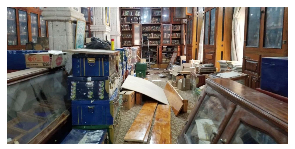
Figure 13.2 Inside the Maktabat al-Awqāf, ca. 2020

twentieth, thus opening a representative window into the history of manuscript production and book culture in Yemen over the course of a millennium.<sup>2</sup>