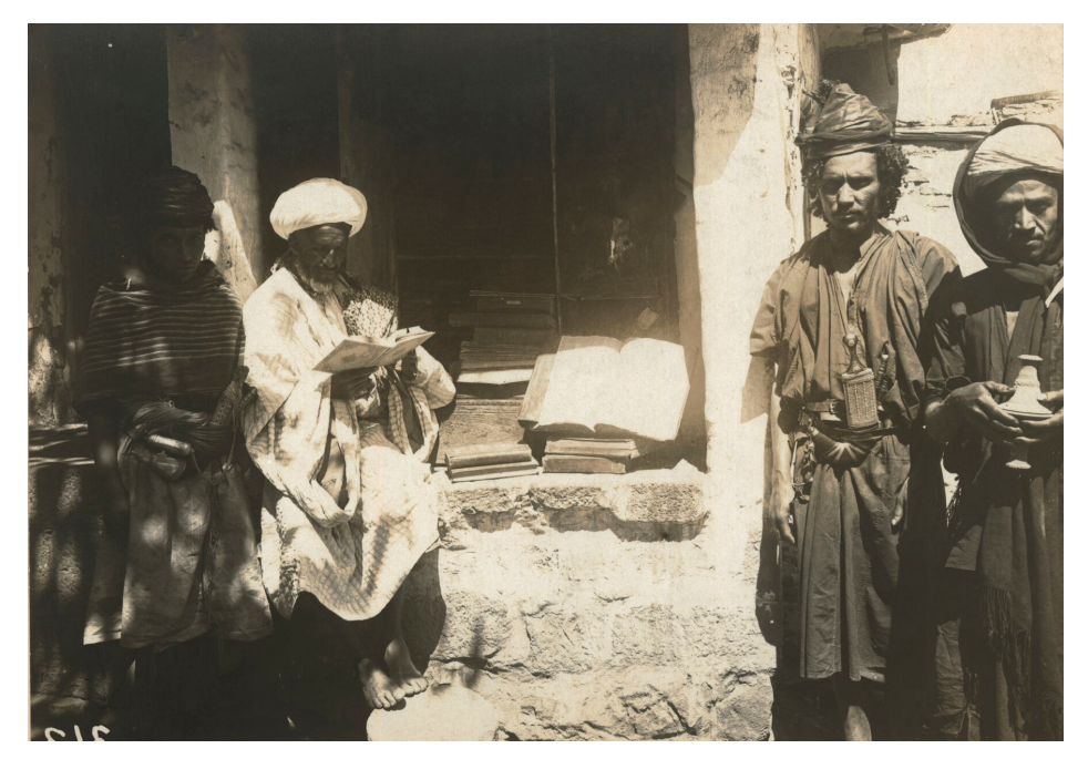
Figure 13.4 Bookshop at Sana'a, Yemen, ca. 1912.