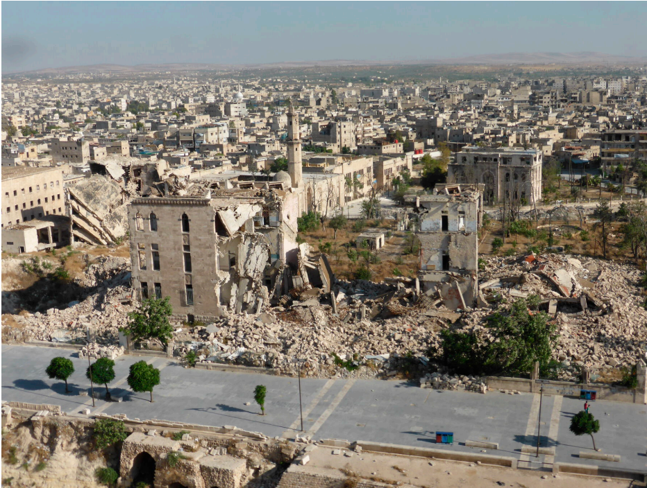
Figure 10.5 The destroyed New Saray.

against the Syrian government, which have prevented foreign investment and the transfer of resources to the country. 37