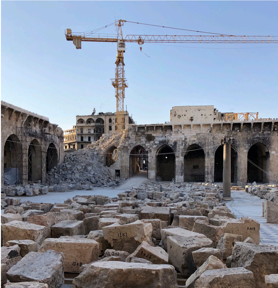
Figure 10.6 Damage to the Great Umayyad Mosque of Aleppo, including damage to the minaret.

signatory to the convention (although not of its First and Second Protocols), as are all the other states directly or indirectly involved in the conflict. It obliges state parties to respect cultural heritage by avoiding its use for military purposes (Article 4.1) and by preventing acts of theft and pillage of cultural properties (Article 4.3). Nonstate actors are also bound to apply its provisions (Article 19.1). Even sanctions are foreseen in case of breach of the convention (Article 28). However, at no time during the conflict in Syria, and in particular in Aleppo, has the Hague Convention been implemented, respected, or applied by the actors involved. While the 1970 convention has been implemented to intercept looted Syrian antiquities, observers agree that its impact on the illicit trade has been very limited. The 1972 convention has no provision for situations of conflict, but it calls for international cooperation for the preservation of World Heritage Sites. All states involved in the conflict are signatories of the 1972 convention and were therefore obliged to limit the damage they caused to Aleppo.