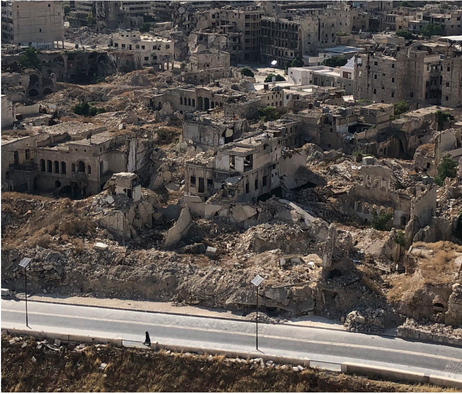
Figure 10.2 Destruction in Aleppo in the area near the citadel.

divided into four phases, each of which is discussed in turn: the opposition takeover of Aleppo (2012–13), the reaction (Operation Northern Storm, 2013–14), the war of attrition (2015), and the retaking of the city (2016).