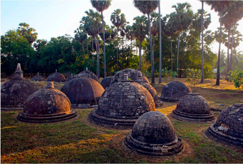
Figure 8.2 Kandarodai site.

Tamil monarch is conflated with the insurgency of the LTTE, whose territory this once was, making the Tamils perpetually disruptive outsiders and making the current Sri Lankan government and Buddhist monastic orders the joint agents in whose pastoral care the land's original identity is finally being safeguarded (fig. 8.2).