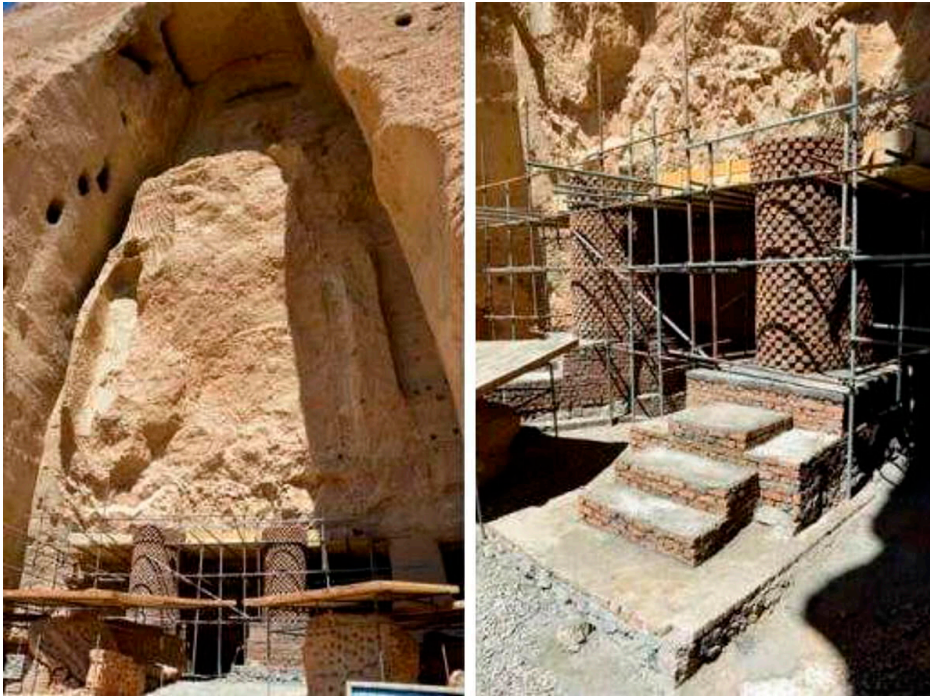
Figure 8.3 Supporting pillars for the eastern Buddha, left, with detail at right

recovering things to recovering their meaning . Surely the layers of accreted meaning count for something, where the destroyed statues were not just ancient Buddhas but also mythic lovers and symbols of Hazara suffering.