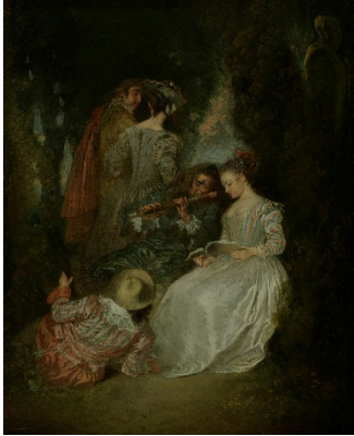
The Perfect Accord (L'Accord parfait) , about 1719 Jean Antoine Watteau (French, 1684-1721) Oil on panel 33 × 27.9 cm (13 × 11 in.) Los Angeles County Museum of Art. Gift of The Ahmanson Foundation EX.2021.4.2