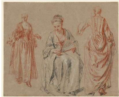
Studies of Three Women , about 1716-1717 Jean Antoine Watteau (French, 1684-1721) Red, black, and white chalk on buff paper 26.8 × 32.7 cm (10 9/16 × 12 7/8 in.) The J. Paul Getty Museum 86.GB.596