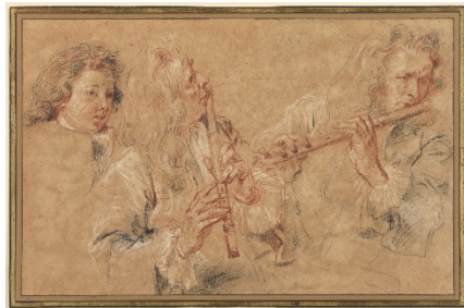
Two Studies of a Flutist and Study of a Head of a Boy , about 1716-1717 Jean Antoine Watteau (French, 1684-1721) Red, black, and white chalk on light brown paper 21.4 × 33.6 cm (8 7/16 × 13 3/16 in.) The J. Paul Getty Museum 88.GB.3