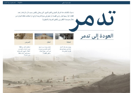
14. Return to Palmyra website screenshot in Arabic