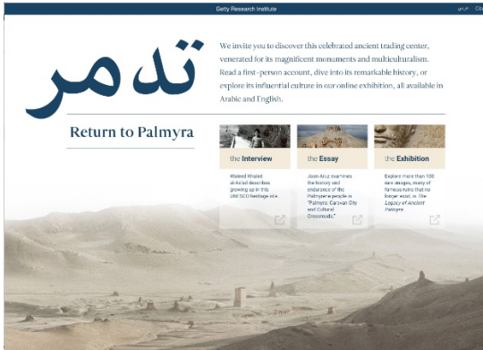
13. Return to Palmyra website screenshot in English