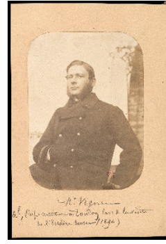
10. Self-portrait , Louis Vignes, 1859. Albumen print. The Getty Research Institute, 2016.R.40