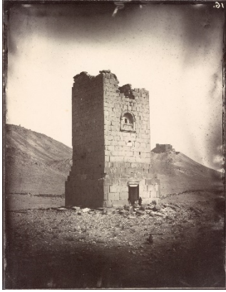
5. Tower tomb of Kitot , Louis Vignes, 1864. Albumen print. 8.8 x 11.4 in. (22.5 x 29 cm). The Getty Research Institute, 2015.R.15