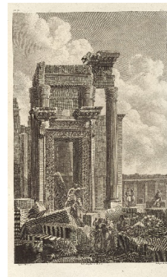
8. Temple of Bel, cella entrance , Jean-Baptiste Réville and Pierre Gabriel Berthault after Louis-François Cassas. Etching. Platemark: 18 x 11.4 in. (46 x 29 cm). From Voyage pittoresque de la Syrie, de la Phœnicie, de la Palestine, et de la Basse Egypte (Paris, ca. 1799), vol. 1, pl. 46. The Getty Research Institute, 840011