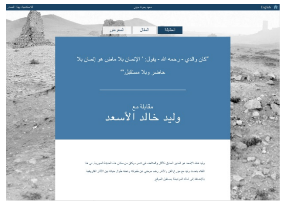
12. Return to Palmyra website screenshot in Arabic