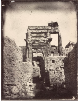
9. Temple of Bel, cella entrance , Louis Vignes, 1864. Albumen print. 8.8 x 11.4 in. (22.5 x 29 cm). The Getty Research Institute, 2015.R.15