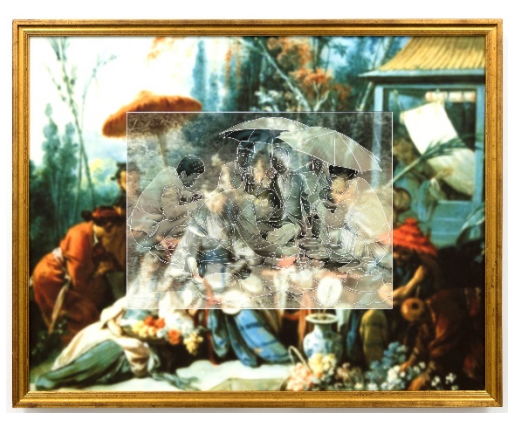
13. Study for "Lunch on the Grass", 2020 Kyungmi Shin (American, born South Korea, born 1963) Inkjet print Image: 71.4 × 91.8 cm (28 1/8 × 36 1/8 in.) Framed: 76.2 × 96.5 × 4.1 cm (30 × 38 × 1 5/8 in.)

EX.2020.6.27