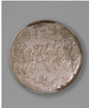
Plate with David and Goliath, Roman