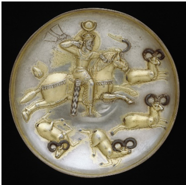
Plate with a King Hunting Rams, Sasanian, AD 459–496