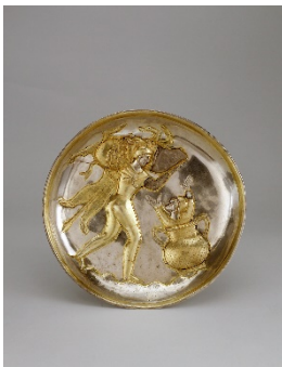
Plate with Herakles and the