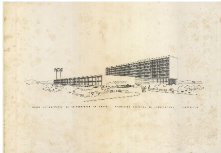
Faculdade Nacional de Arquitetura Building at Cidade Universitária of Rio de Janeiro, 1957 Jorge Machado Moreira Perspective 23.5 x 32.0 cm