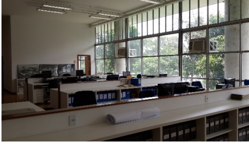
NPD Consultation Area Photos, 2013 Alexandre Pessoa