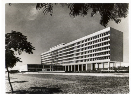
Faculdade Nacional de Arquitetura Building at Cidade Universitária of Rio de Janeiro, 1957