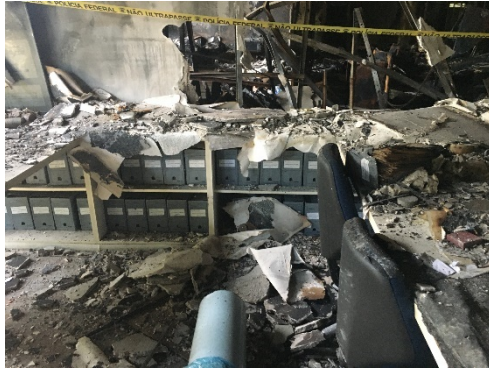
Shelves with damaged archive boxes in the Research and Documentation Center library room, 2021