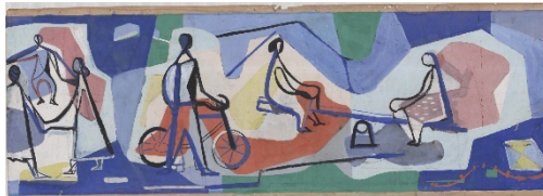
Study for Artistic Mural at Pedregulho Social Housing Complex, 1946 Roberto Burle Marx Gouache on Canson paper 55.0 x 151.0 cm