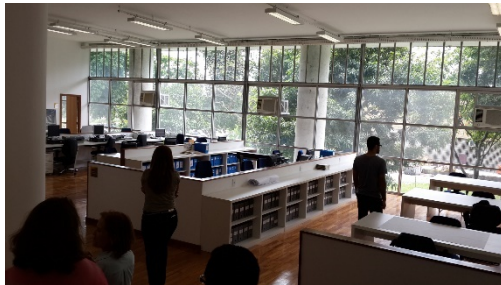
NPD Consultation Area Photos, 2013