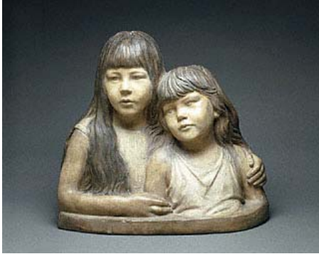
Title: Double Portrait of the Artist's Daughters Artist: Adolf von Hildebrand (German) Date: 1889 Medium: Polychromed terracotta

Go to the West Pavilion, Plaza Level, Gallery W103