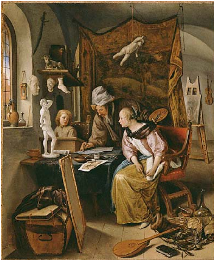
Title: The Drawing Lesson Artist: Jan Steen (Dutch) Date: 1665 Medium: Oil on canvas