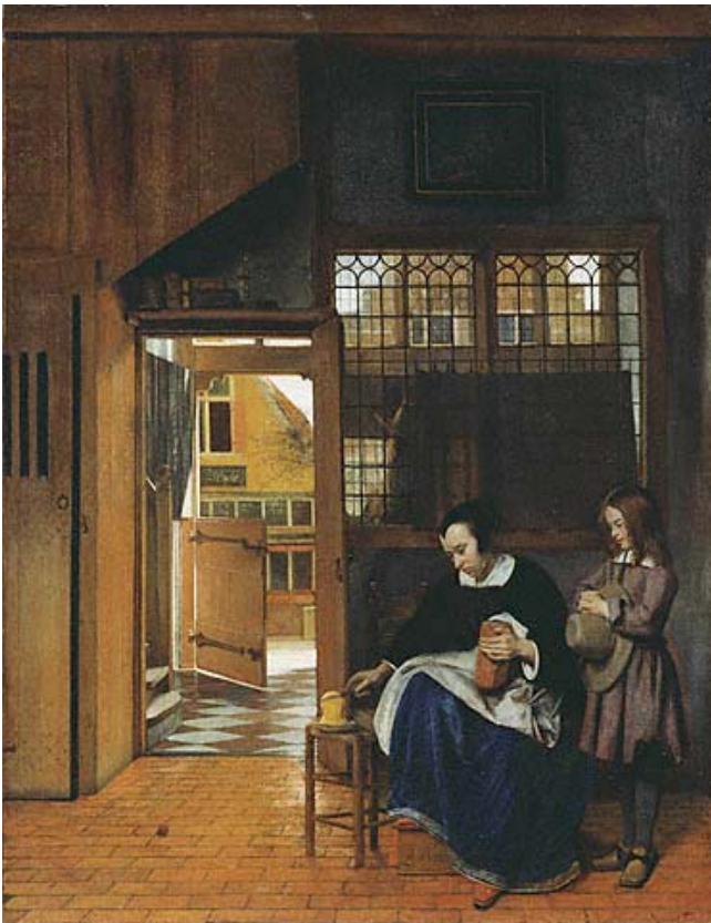
Title: A Woman Preparing Bread and Butter for a Boy Artist: Pieter de Hooch (Dutch) Date: 1660-1663 Medium: Oil on canvas