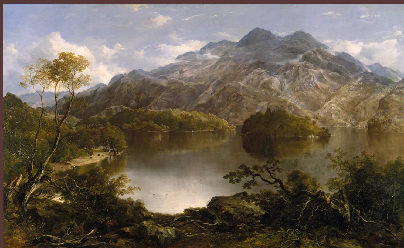
Horatio McCulloch, Loch Katrine , 1866

The release of Sir Walter Scott's epic poem The Lady of the Lake catapulted Loch Katrine and the Trossachs—a lush, wooded area northeast of Glasgow renowned for its scenic views and lakes, including Loch Katrine—into fashionable tourist destinations. The poem also inspired many artists to represent the lake, including Horatio McCulloch and J.M.W. Turner.