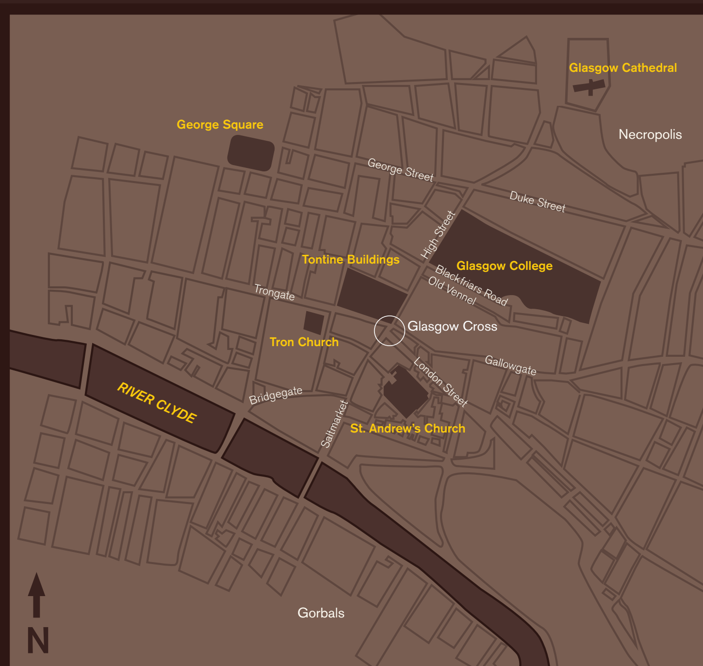
Glasgow city center

charged by the Improvement Trust to record these sites before they were demolished, Annan also included the laborers and families who inhabited the tenements, injecting a sense of humanity into his work. Urinals, drains, laundry, and other signifiers of modernized sanitation further suggest that Annan was attempting to portray progress already underway.