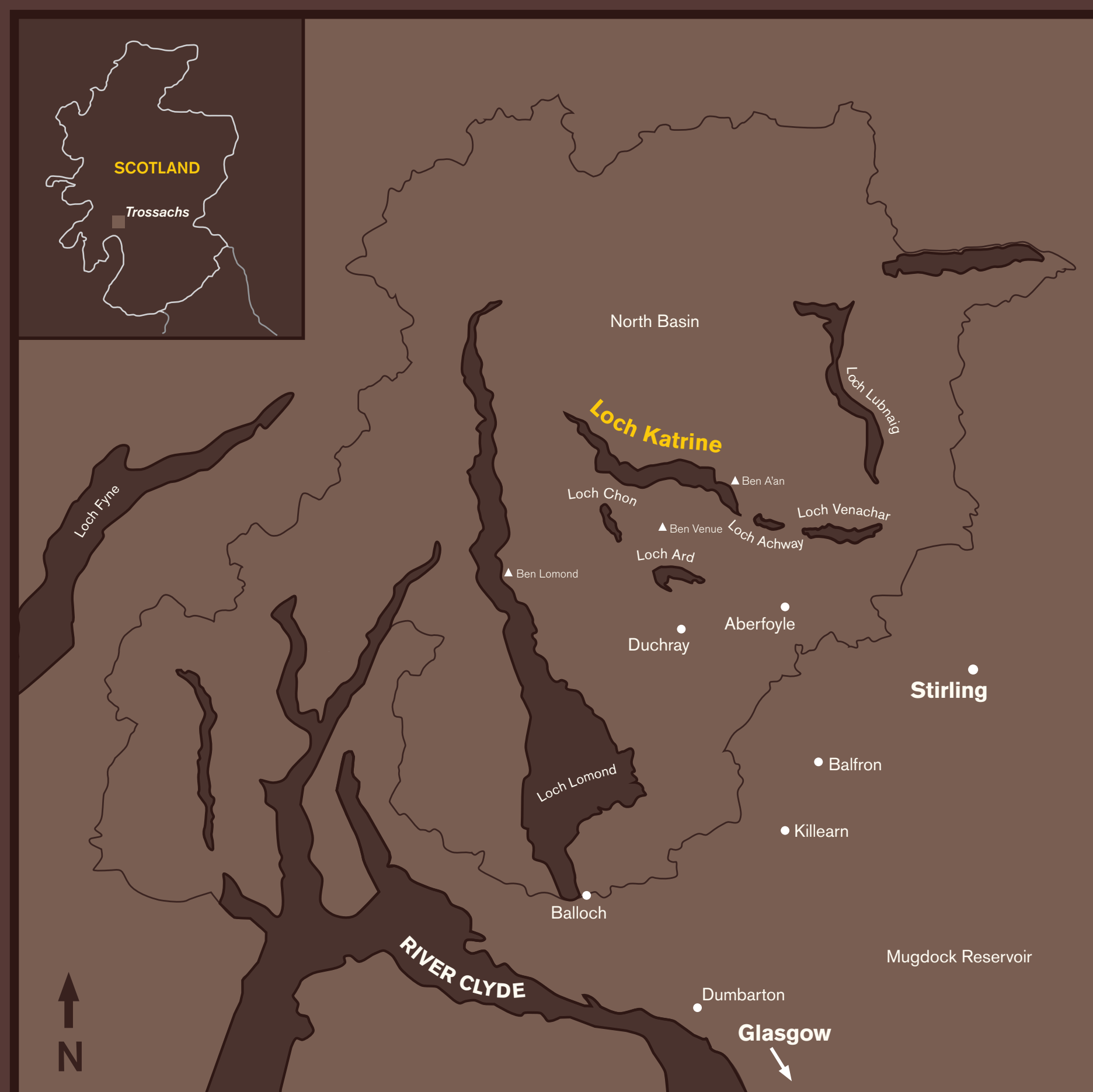
Map of the Trossachs, featuring Loch Katrine

photographed the aqueduct around 1859. On display in this gallery are some of his earliest photographs of the subject, at one time compiled in a book called Views on the Line of the Loch Katrine Waterworks that has since been disbound. They underscore the relationship between man and the environment, and invite contemplation about the nature of progress through industry.