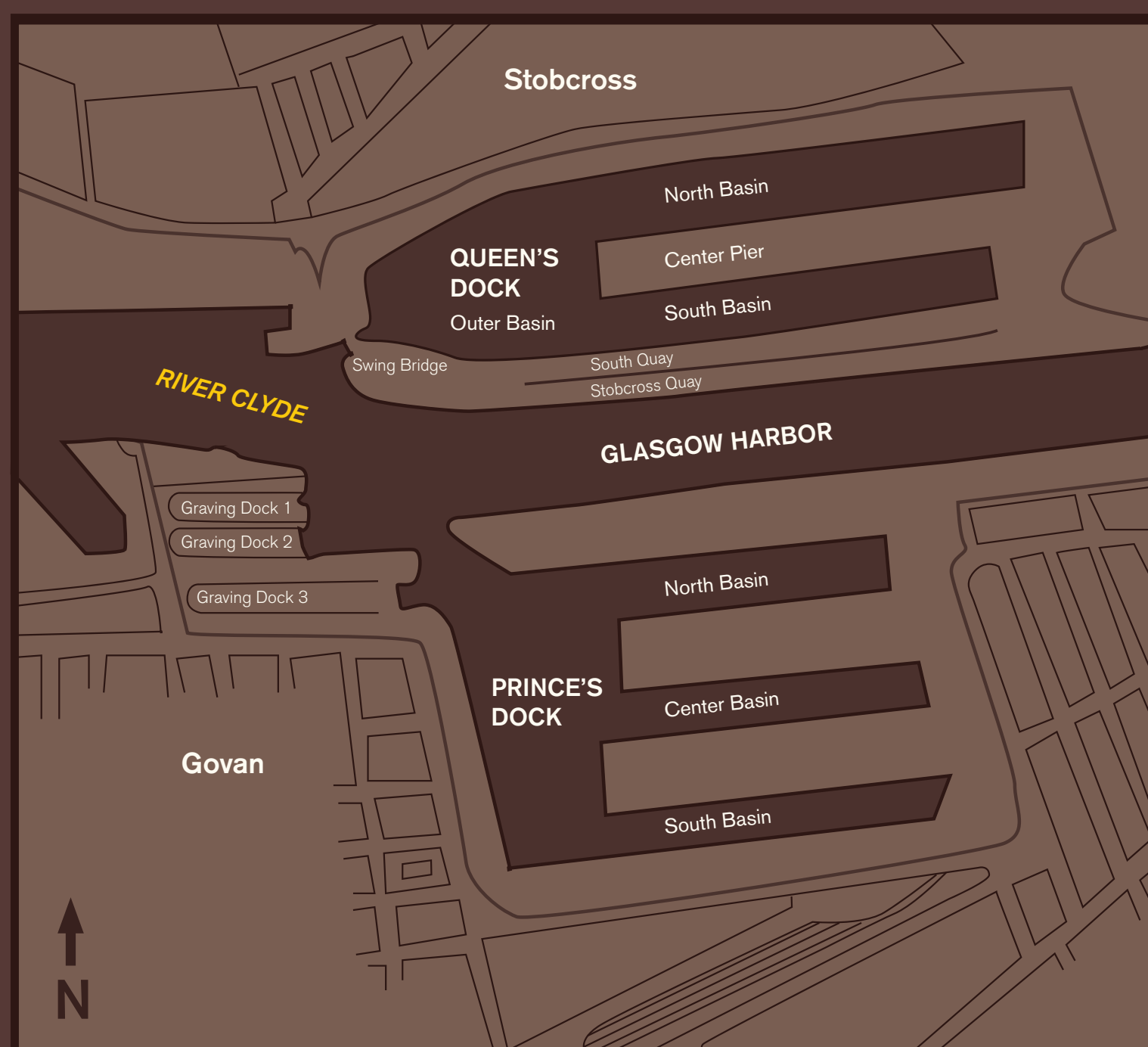
Aerial view of Queen's Dock and Prince's Dock at Glasgow Harbor

like the Loch Katrine aqueduct, concerned a civic initiative designed to improve the built environment. Although Annan's images of this initiative were shown in Paris at the Exhibition Universelle in 1877, they were all but forgotten in the context of his career, housed for decades in the Clyde Navigation archives as anonymous works.