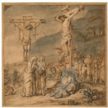
37. Samuel van Hoogstraten Dutch, 1627 - 1678 The Crucifixion , About 1650 Brown ink, gray wash, and red chalk over black chalk, with corrections by the artist in white opaque watercolor Unframed: 24.5 × 25.1 cm (9 5/8 × 9 7/8 in.) The J. Paul Getty Museum, Los Angeles 2020.39