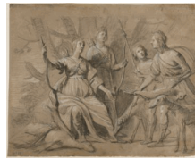
36. Gerrit van Honthorst Dutch, 1590 - 1656 Allegorical Portrait of the Four Eldest Children of the King and Queen of Bohemia , About 1631 Gray wash over black chalk with brown ink, heightened with white opaque watercolor, on brown paper, incised for transfer Unframed: 24.9 × 31.1 cm (9 13/16 × 12 1/4 in.) The J. Paul Getty Museum, Los Angeles 2020.38