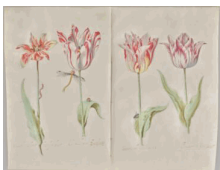
39. Jacob Marrel German, active Netherlands, 1613/1614 - 1681 Four Tulips , About 1635-45 Watercolor and opaque watercolor heightened with gum over metalpoint on parchment Unframed (irregular): 33.9 × 44.6 cm (13 3/8 × 17 9/16 in.) The J. Paul Getty Museum, Los Angeles 2020.41