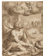
38. Karel van Mander Dutch, 1548 - 1606 Manasseh, Repentant Sinner , 1596 Brown ink with brown wash over black chalk, incised for transfer Unframed: 18.2 × 14 cm (7 3/16 × 5 1/2 in.) The J. Paul Getty Museum, Los Angeles 2020.40