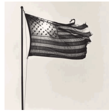
11. Robert Mapplethorpe American, 1946 - 1989 American Flag , 1977 Gelatin silver print Image: 35.3 × 35.3 cm (13 7/8 × 13 7/8 in.) Jointly acquired by the J. Paul Getty Trust and the Los Angeles County Museum of Art, with funds provided by the J. Paul Getty Trust and the David Geffen Foundation © Robert Mapplethorpe Foundation 2011.7.6