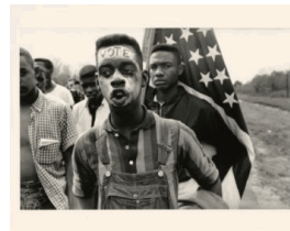
13. Bruce Davidson American, born 1933 March from Selma, Alabama, from Time of Change, Negative, 1965; printed later Gelatin silver print Image: 21.7 × 32.8 cm (8 9/16 × 12 15/16 in.) The J. Paul Getty Museum, Los Angeles 2018.40.9