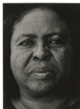
14. Louis Draper American, 1935 - 2002 Fannie Lou Hamer, 1971 Gelatin silver print Image: 18.1 × 13.3 cm (7 1/8 × 5 1/4 in.) The J. Paul Getty Museum, Los Angeles 2021.10.2