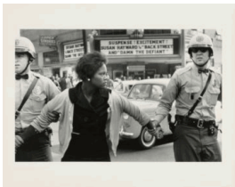
12. Bruce Davidson American, born 1933 Birmingham, Alabama, from Time of Change, Negative, 1963; print, 1970s Gelatin silver print Image: 19.9 × 31.1 cm (7 13/16 × 12 1/4 in.) The J. Paul Getty Museum, Los Angeles 2018.40.7