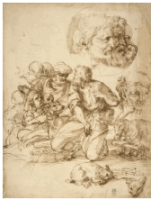
13. Agostino Carracci Italian, 1557 - 1602 A Group of Shepherds, and Other Studies , About 1598-1600 Brown ink 40.5 × 30.8 cm (15 15/16 × 12 1/8 in.) The J. Paul Getty Museum, Los Angeles 86.GA.726