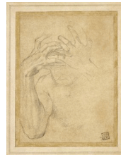
16. Agnolo Bronzino Italian, 1503 - 1572 Study of Jealousy , About 1545 Black chalk 16.2 × 11.9 cm (6 3/8 × 4 11/16 in.) The J. Paul Getty Museum, Los Angeles 88.GB.108