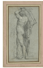
14. Titian (Tiziano Vecellio) Italian, about 1487 - 1576 Nude Man Carrying a Rudder on His Shoulder , About 1555-56 Black chalk, heightened with white chalk on blue paper 28.7 × 15.6 cm (11 5/16 × 6 1/8 in.) The J. Paul Getty Museum, Los Angeles 87.GB.35