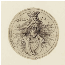
17. Virgil Solis German, 1514 - 1562 Design for a Bookplate or a Glass Etching , About 1550-60 Black ink and gray wash Diam.: 5.9 cm (Diam.: 2 5/16 in.) The J. Paul Getty Museum, Los Angeles 89.GG.22