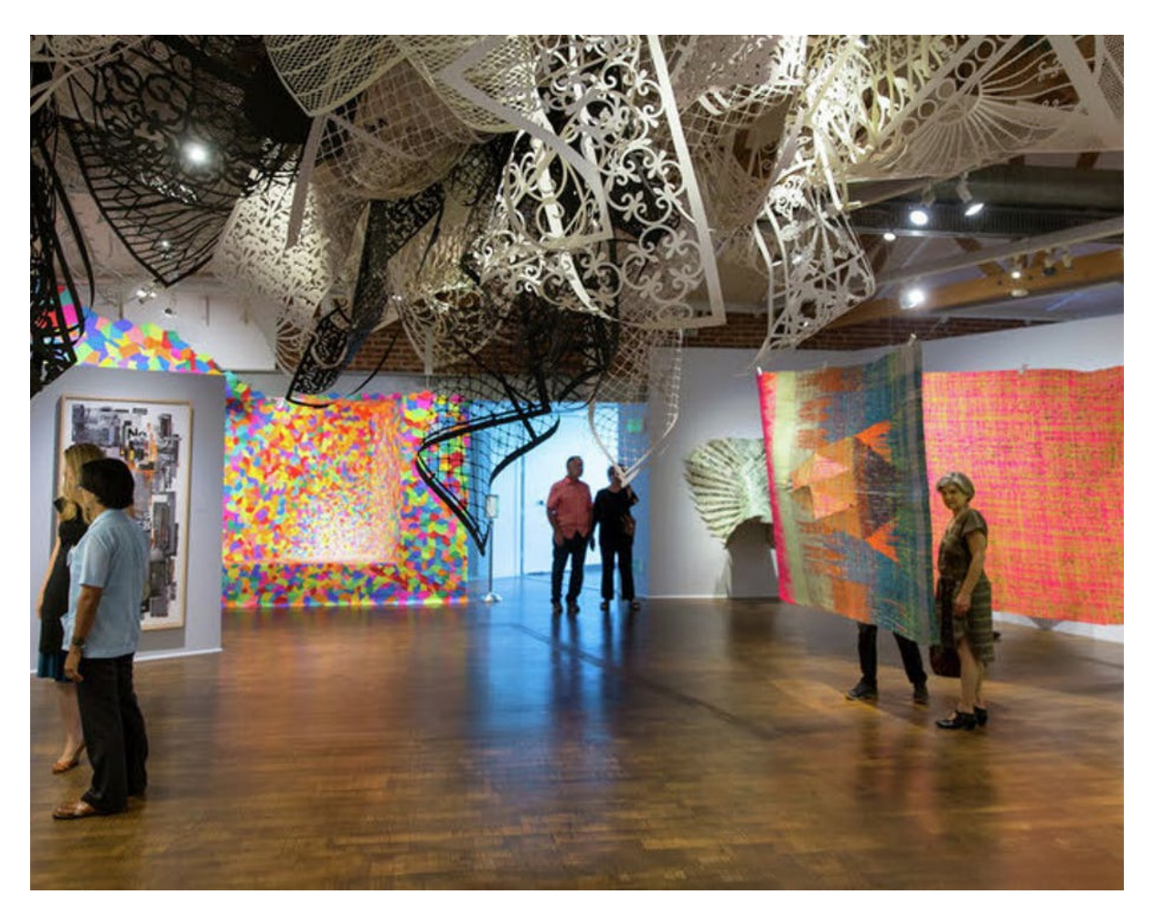
Craft Contemporary Paperworks installation image, September 2015.

Since launching the Fund in March 2020, Getty has been joined by other leading foundations and philanthropists from Southern California and the nation to build the fund to over $30 million. Now, to reach our goal of sustaining at least 70 cornerstone arts nonprofits in our region with two years of operating grants, we seek to raise an additional $10 million from individuals committed to the vitality of arts in our community. The LA Arts Recovery Fund has already made 80 grants to small museums, nonprofit galleries, and visual arts organizations.