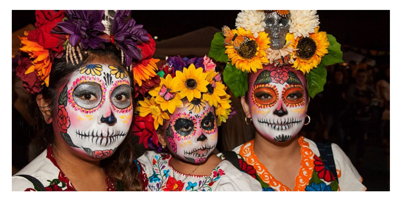
2015 Día de los Muertos

In addition to vital financial assistance, grantees will receive technical support from a network of experts. Support will include assistance for navigating reopening under new publichealth guidelines, developing online programming, adopting effective governance practices, building successful fundraising plans, and executing adapted business models.