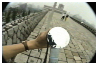
Sasaki Naruaki, Taller Pole , 1985, color video. © Sasaki Naruaki