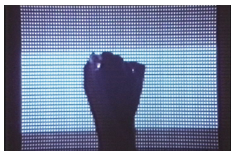
CTG (Computer Technique Group), Computer Movie No. 1 , 1968, 16mm film transferred to video. © 1968 CTG