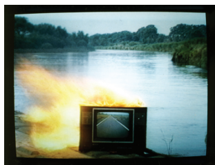
Shimano Yoshitaka, TV Drama , 1987, color video. © Shimano Yoshitaka