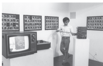
Imai Norio, Production still of On Air , 1980. © Imai Norio