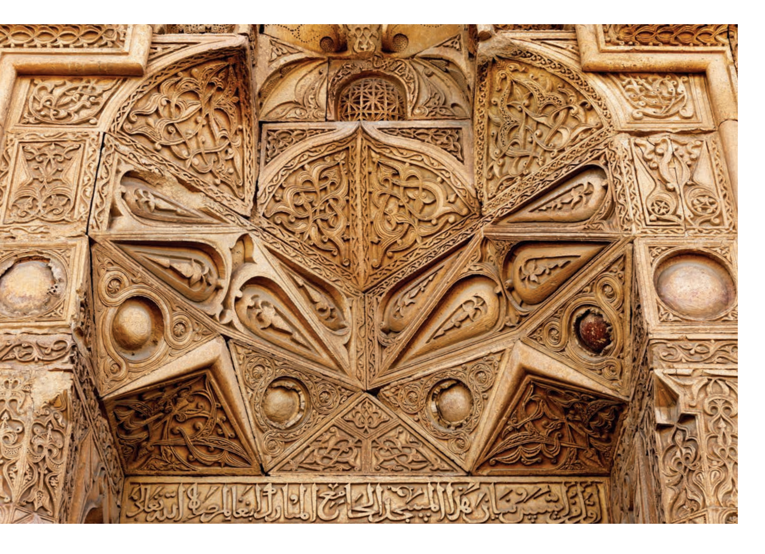
Detail of the facade of the Great Mosque and Hospital of Divriği in Turkey.

One major focus for Connecting Art Histories is the art and architecture of the greater Mediterranean Basin, particularly during the Medieval and Early Modern periods. Several grant-funded projects are redefining scholarship of these periods, overcoming the traditional division between the study of the West and the East, or the Christian and the Islamic worlds. This intellectual segregation can often be traced back to the rise of modern nation-states and their focus on creating national cultural identities, which in turn led to separate and distinct art histories. Recent Connecting Art Histories projects have taken a more holistic view, looking at the ways various cultures interrelated and allowing a rising generation of younger scholars to produce a more integrated history of art in the Mediterranean region that crosses national, linguistic, religious, and ethnic borders.