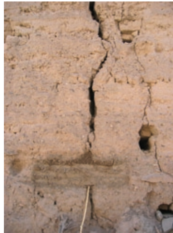
FIGURE 24 A completed stitch.