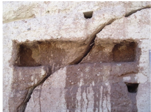
FIGURE 20 Wetting the finished chase.