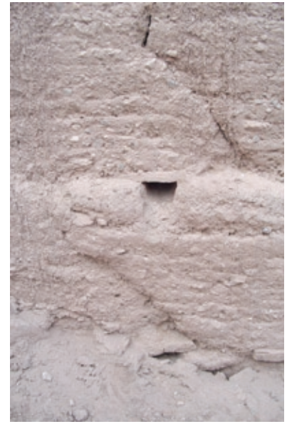
FIGURE 16 Detail of pisé, Ladakh.