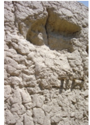
FIGURE 6 Timber-edged stitch with additional twig reinforcement, Armenia.