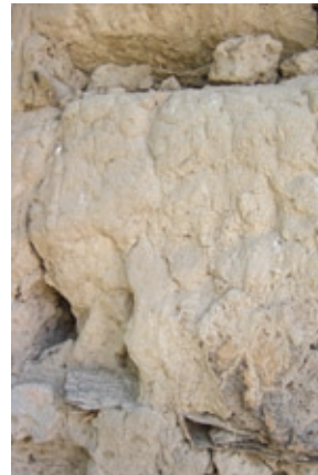
FIGURE 5 Bark ring beam, Armenia.