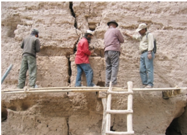
FIGURE 25 A second stitch above the preceding one.