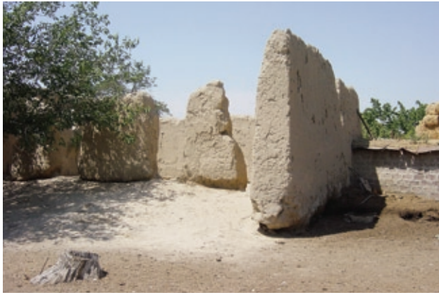
FIGURE 2 Pisé mosque with horizontal bark and twig ring beams in regular lifts, Armenia.