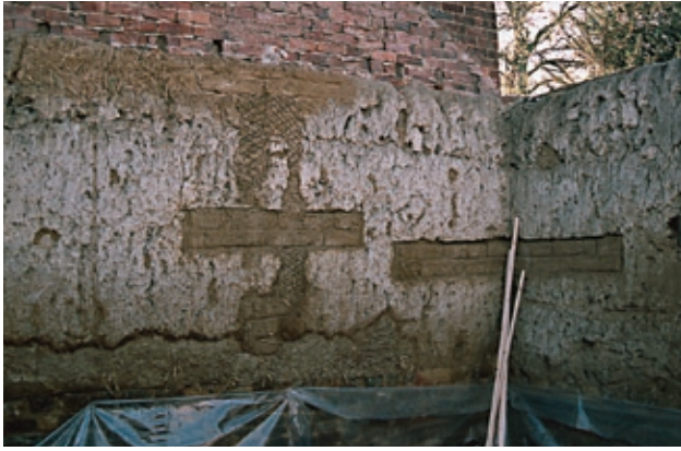
FIGURE 1 Stainless steel and adobe soft-stitch repairs to a corner and central end wall in Leicestershire, UK. The structure is an example of cob construction.

hemp fiber mats that were woven in situ, which made a complete circular “ring beam” around the tower. The author has no idea what happened to the other three chases formed, but he assumes that they were dealt with in a similar way. The masons made no explanation of what they were doing, but the activity remains vivid in the mind of the author.