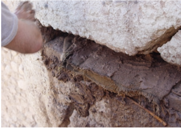
FIGURE 21 Filling the chase with yagtsa and hemp matting.