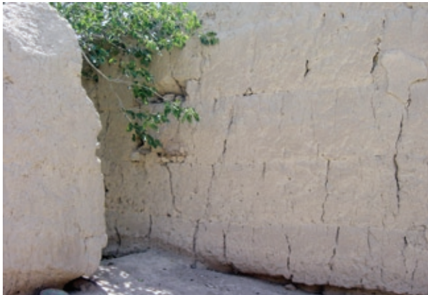
FIGURE 4 Pisé lifts in a mosque in Armenia. The visible lifts include organic fiber.