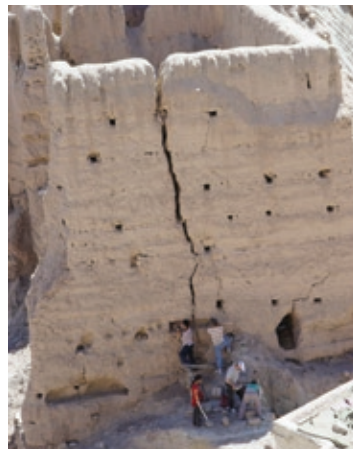
FIGURE 26 Conservation work in progress, Ladakh.