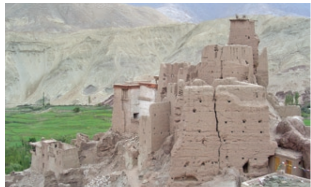
FIGURE 13 Pisé on stone plinth castle and monastery at Basgo, Ladakh.

At a recent summer school in Ladakh, on the western Tibetan plateau, the author had the opportunity to demonstrate repairs to pisé structures from the fifteenth century. Here the pisé was constructed in short lifts of approximately 15 cm (about 6 in.) each. In every third lift, a vegetable “mattress” was rammed into the construction (fig. 17). Here cracks were stitched in the same techniques examined by the author across Asia, and