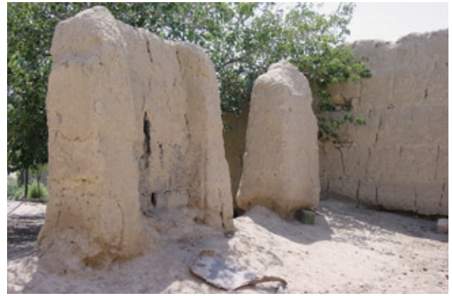
FIGURE 3 Mihrab of a pisé mosque in Armenia.