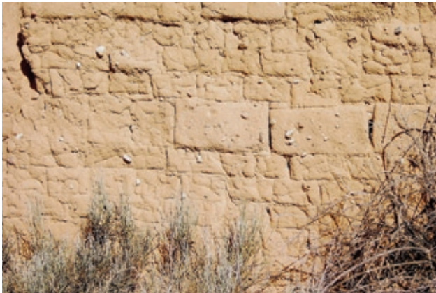
FIGURE 11 Nineteenth-century wall with large-block ring beam, Kyrgyzia. These modern remnants show horizontal changes in block size.