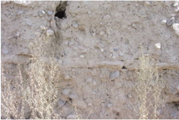
FIGURE 9 City wall with horizontal turf ring beam, Armenia.