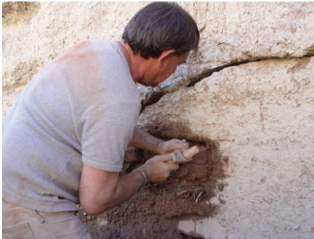
FIGURE 23 Dry packing the top of the stitch.