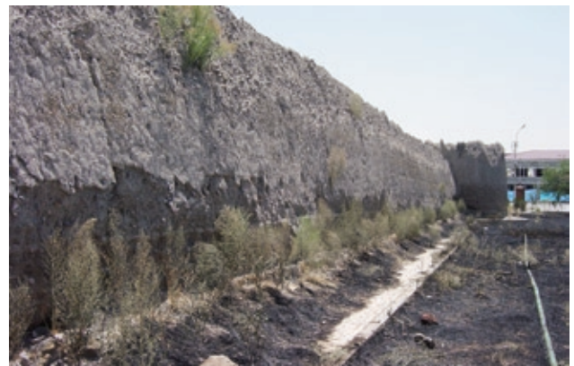
FIGURE 8 City wall with pisé lifts, Armenia. A horizontal turf lift is revealed behind plasters on the lower wall.