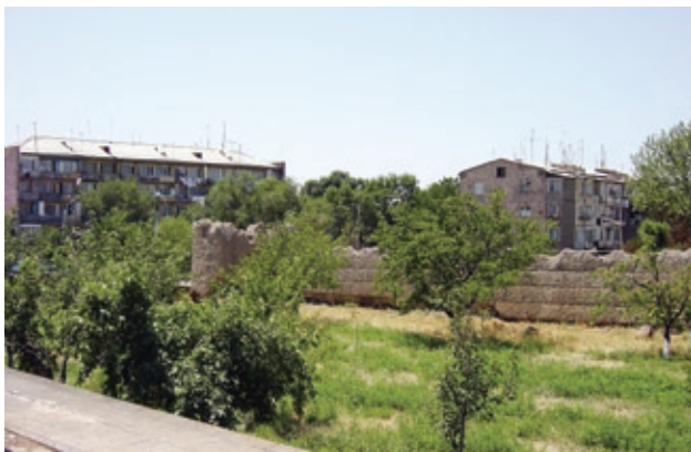
FIGURE 7 Pisé city wall, Yerevan, Armenia. There are regular horizontal lifts, each lift line concealing a turf lift.