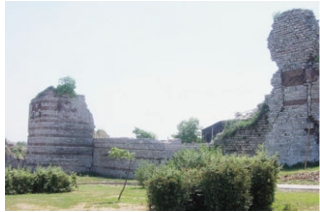
FIGURE 10 Byzantine city wall with brick ring beams, Istanbul.