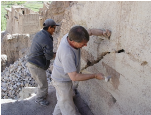
FIGURE 19 Cutting the chase in the shape of a staple.