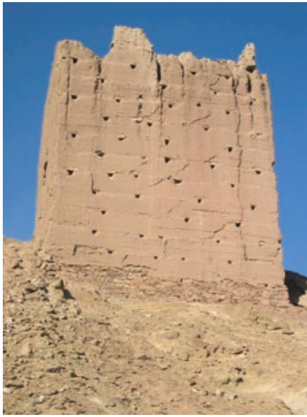
FIGURE 14 Pisé lookout tower in Ladakh, exhibiting typical tremor damage.