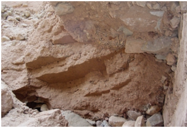
FIGURE 17 Detail of horizontal vegetation ( yagtsa ) mattresses at every third lift. Ladakh.

these were confirmed to have been described in cultural records both by Ladakhi monks and by Bhutanese builders. A Himalayan architect kindly made a drawing of the techniques used (fig. 18).