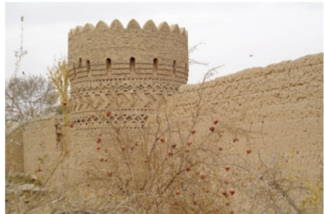
FIGURE 12 Adobe wall with horizontal vegetation mattresses in Yazd, Iran. The tower, which has been rebuilt, has no ring beam.

In the Silk Road cities of Central Asia, the theme continues right across China (figs. 13–16).