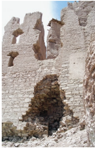
FIGURE 15 Stone and pisé castle in Ladakh.