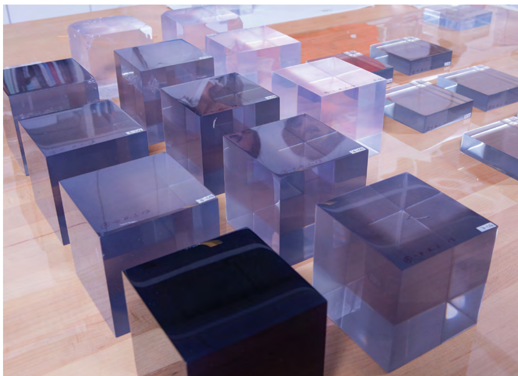
Polyester test samples being used in GCI research exploring minimally invasive techniques to repair plastic works of art.