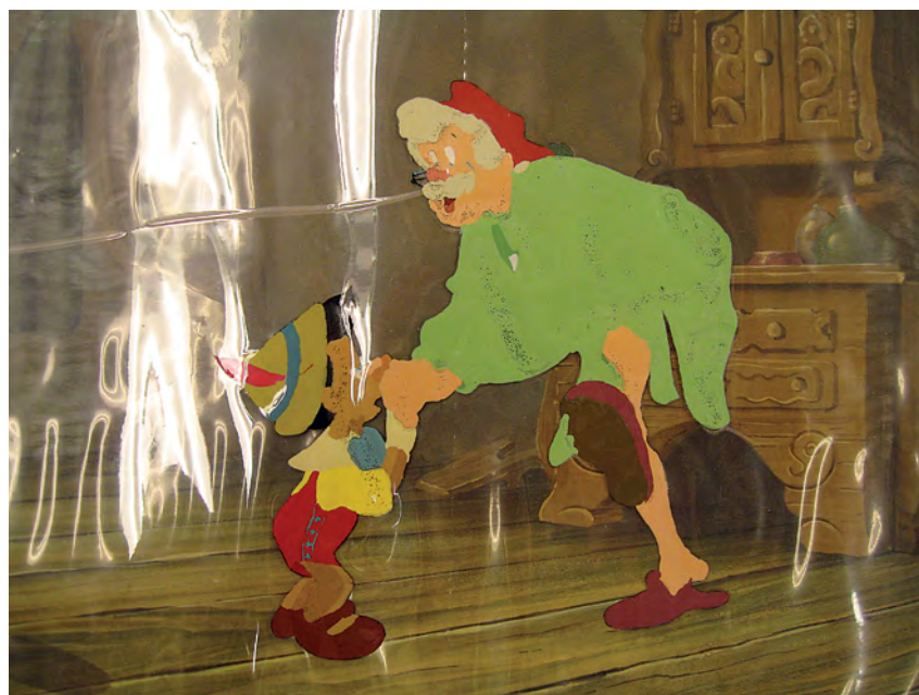
A detail of an animation cel from the Disney film Pinocchio (1940). The cel displays buckling, another problem affecting some cels in the ARL collection.

On a study group of more than a hundred cels, noninvasive analyses of color and gloss were performed with UV-Vis spectrophotometry, while the plastic types were identified using Fourier-transform infrared spectrometry. Other analytical methods were invasive and thus could be employed only on minute samples. These methods included gas chromatography–mass spectrometry for measuring the extent of hydrolysis of the polymers and, with a pyrolyzer added to this instrument, identifying cel plasticizers. Thermomechanical analysis and dynamic mechanical analysis measured the mechanical response of the cels to changing temperature. For the invasive tests, at least two film productions from each decade were studied, yielding a total of eighty-one physical samples removed from the cel edges.