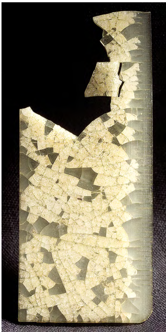
A cellulose nitrate ruler from the 1920s displaying typical hydrolytic breakdown. The ruler is badly cracked and produces nitric acid as a degradation product.

Yvonne Shashoua is a senior researcher in the Department of Conservation, National Museum of Denmark, where she researches the degradation and conservation of plastics objects and artworks.