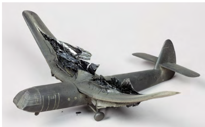
A model of a British Airspeed Horsa. Models like this were used to teach aircraft recognition during World War II. Seven decades later, many of these early examples of injection-molded cellulose acetate plastic are disintegrating spontaneously in the National Air and Space Museum collection.