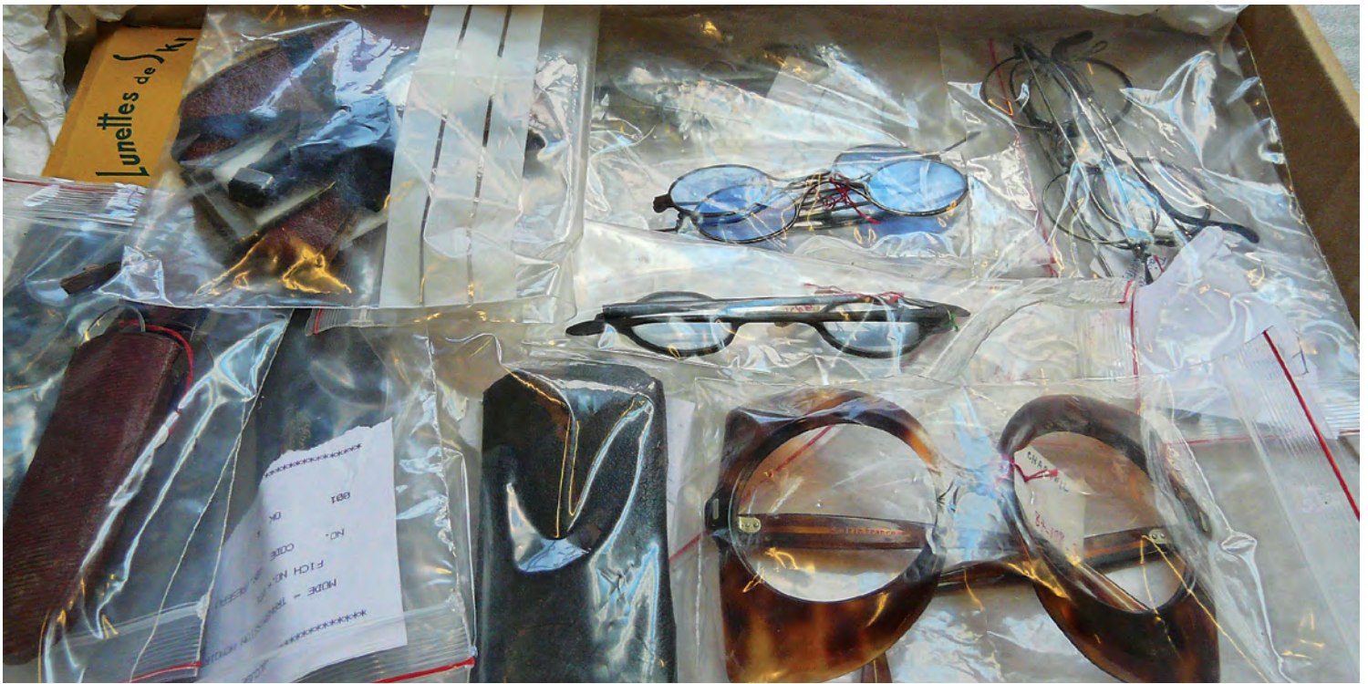
Plastic objects from the collection of Musée de la Mode et du Textile de la Ville de Paris (Musée Galliera).

chloride in the sachet. Ageless reduces the oxygen concentration of an airtight container to 0.01% or less.