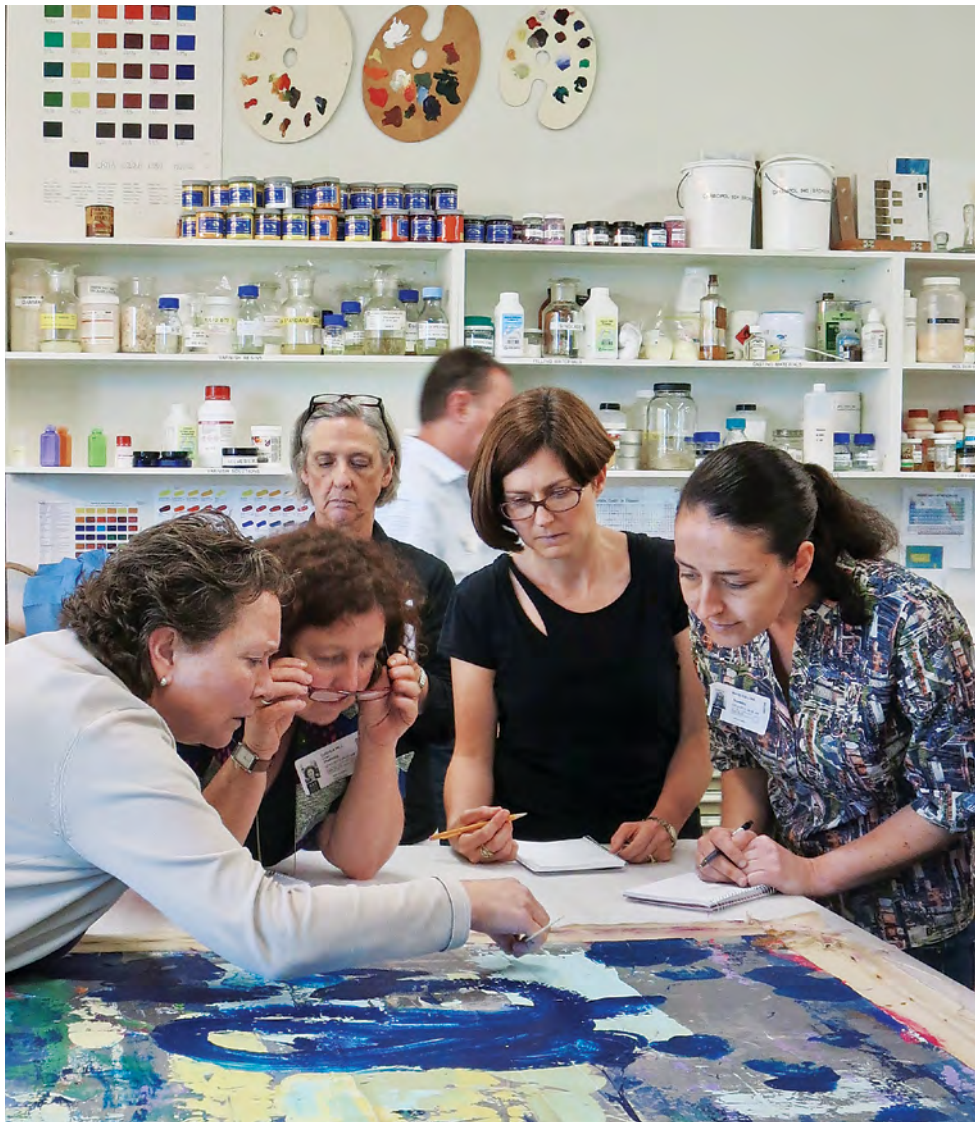
Participants in the fourth Cleaning of Acrylic Painted Surfaces workshop, which was held in Sydney.

held for the local museum community, to make new research on acrylic paints available to a wider audience.