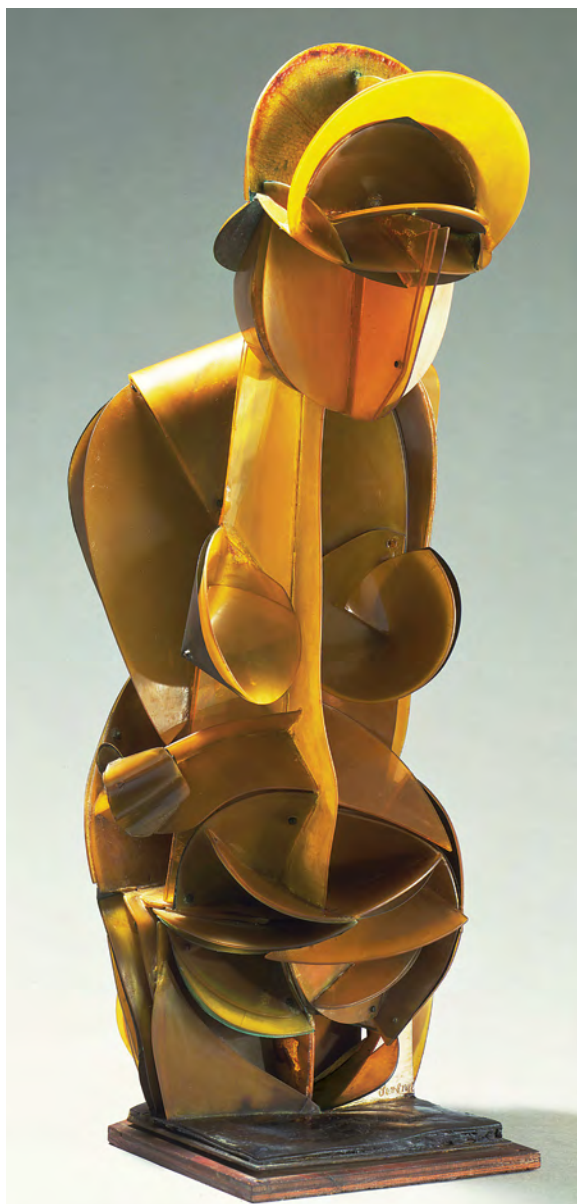
Torso (1924–26) by Antoine Pevsner (1886–1962). Plastic and copper, 29 1/2 x 11 5/8 x 15 1/4 in. (74.9 x 29.5 x 38.7 cm). Katherine S. Dreier Bequest. The Museum of Modern Art, New York. For Antoine Pevsner © 2014 Artists Rights Society (ARS), New York / ADAGP, Paris.

In terms of the prospects for advancing conservation of plastic, the news remains mixed. We are faced with the challenge of learning about a diverse, rapidly evolving category of materials with which we have limited experience. How, for example, can we expect to have the same level of knowledge and experience we have with oil paint, bronze, or stone? Not only are there hundreds of types of plastic, each is rarely composed of a single compound. For each polymer, countless modifications are possible;