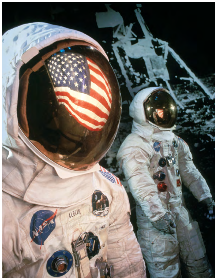
Space suits worn by Neil Armstrong and Edwin Aldrin when they climbed down from their lunar module “Eagle” in July 1969 to become the first humans to walk on the moon. These suits are mainly constructed of synthetic polymers.

Many processing technologies produce different materials from the same ingredients, such as sheets, fibers, and other extrusions; molded objects; foams; and printed objects. There is the added complication of many processes changing over time and becoming obsolete and forgotten. Beyond mass-produced items, particular processes of individual artists and designers kick in a whole new set of variables, as the possibilities of these extraordinary materials are explored and their performance is pushed in ways rarely imagined by their manufacturers. Will this intricate landscape be simplified any time soon? For the time being, developments in plastics technology will likely outpace advances in conservation research.