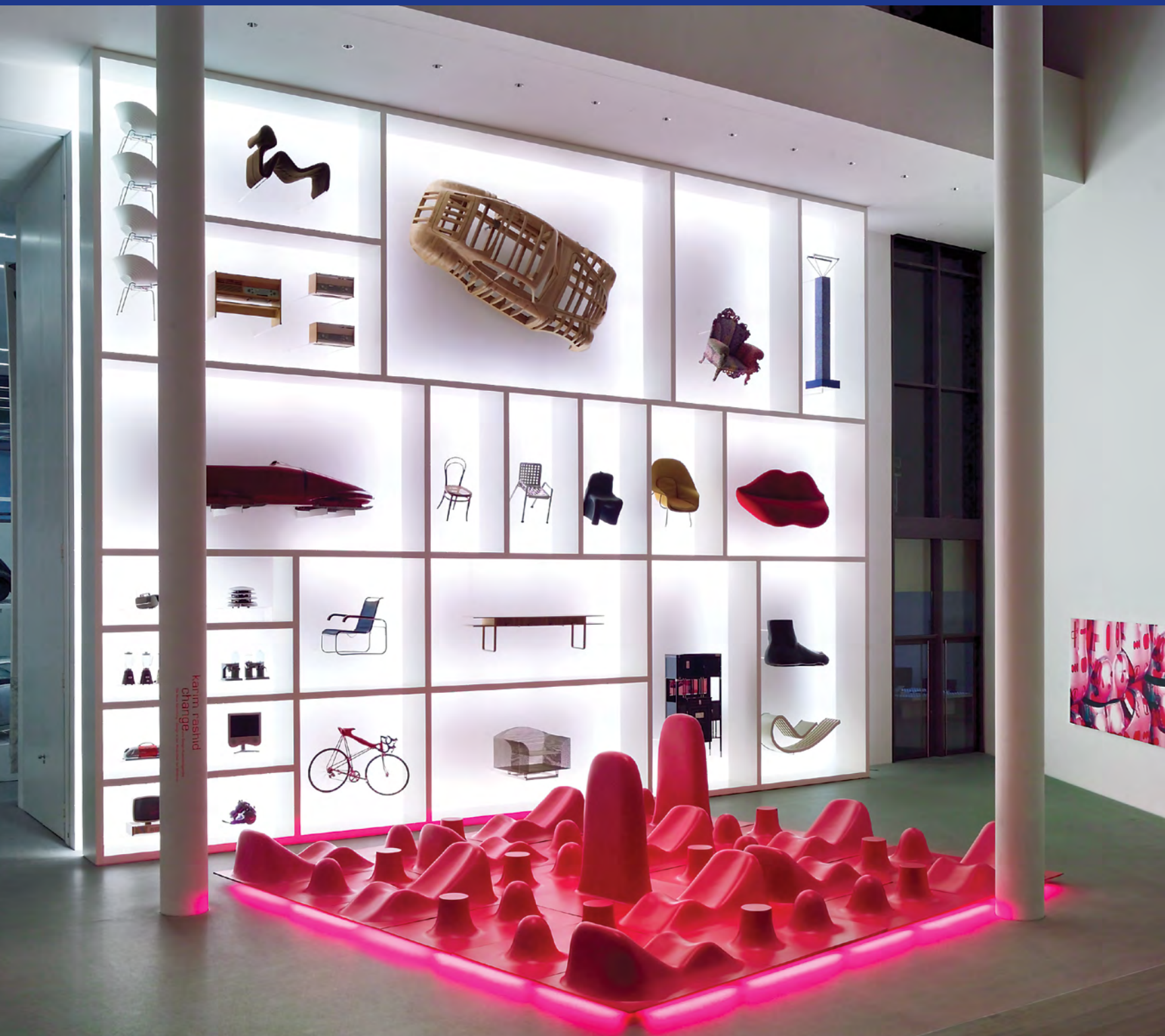
A gallery in Die Neue Sammlung, The International Design Museum Munich.