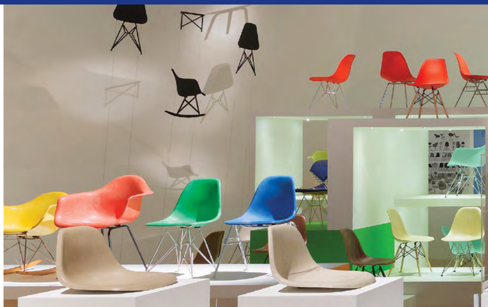
A portion of the 2013 exhibition Essential Eames: A Herman Miller Exhibition , copresented by the ArtScience Museum in Singapore and Herman Miller in collaboration with the Eames Office.

Videos from talks at the “Preservation of Plastic Artefacts in Museum Collections” POPART project conference, 7–9 March 2012, Paris. Description of the POPART project and overview of relevant workshops and publications.