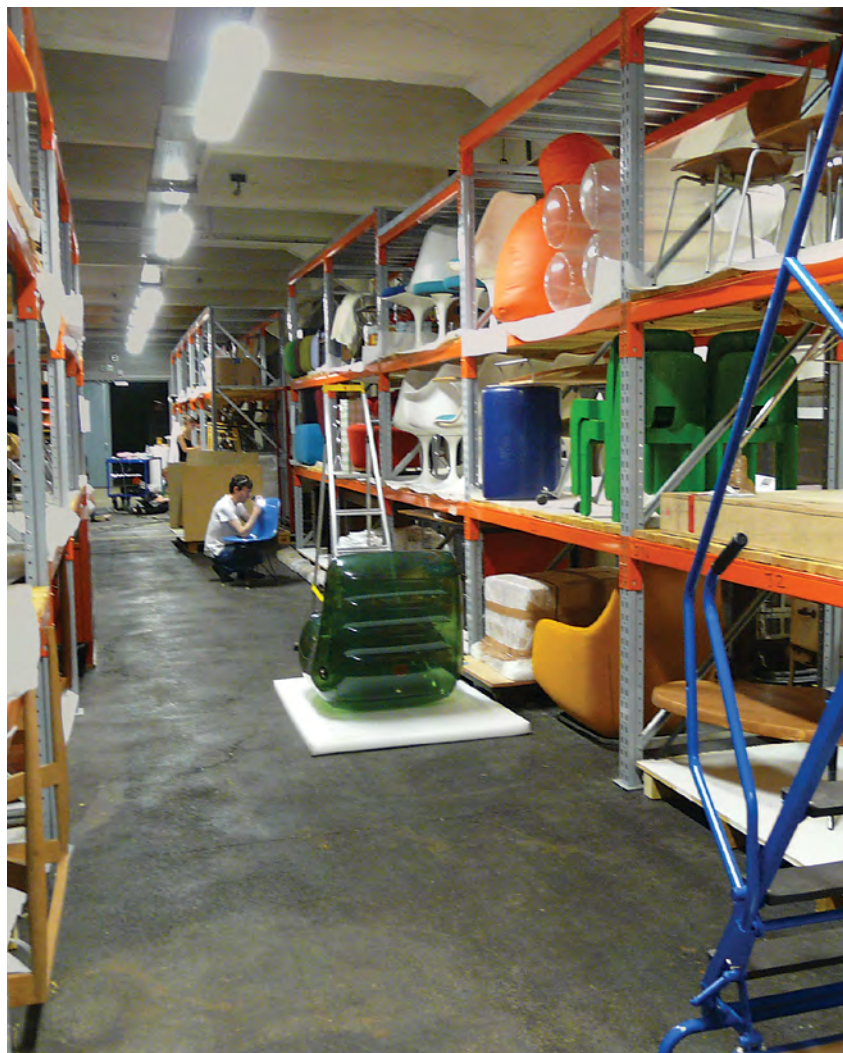
The storeroom of Musée d'Art Moderne de Saint-Étienne Métropole, France.

In many museum storage facilities, objects are grouped by historical period rather than material type. Macroclimates are therefore a compromise between the average requirements for all the materials in the location and the resources available. Although microclimates tailored to suit each plastic type would be optimal, costs often preclude them.