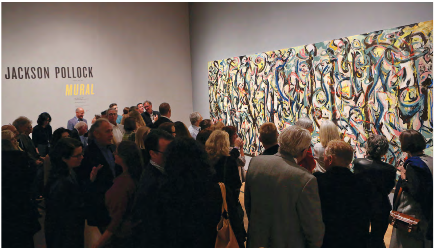
The Getty exhibition opening of the newly conserved and scientifically studied Jackson Pollock painting Mural (1943). Painting: University of Iowa Museum of Art, Gift of Peggy Guggenheim, 1959.6. Reproduced with permission from the University of Iowa.