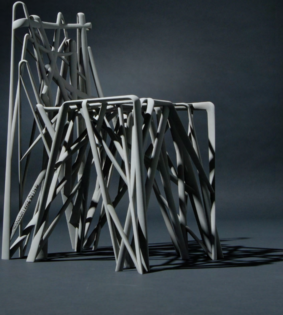
A plastic chair, designed by Patrick Jouin (Solid C2, 2004) and in the collection of Die Neue Sammlung, The International Design Museum Munich.

like cellulose nitrate and sticky PVC. Nowadays research is also driven by interest in the technology of an artifact per se. We have learned about a set of degradation processes to which particular polymers are prone (hydrolysis and oxidation, for example) and about the factors that drive them (light, temperature, moisture, and oxygen). The degradation of certain artifacts has been attributed to specific processes, and attempts have been made to demonstrate the connection analytically. As a consequence of this knowledge transfer process, we have identified environmental conditions that we believe slow deterioration of certain unstable plastics. We use this information for basic storage strategies: to segregate certain classes of plastic and rubber artifacts (particularly if they are degrading); to understand which absorbents will work better on certain classes; and to decrease temperature and remove light (and, in some cases, oxygen).