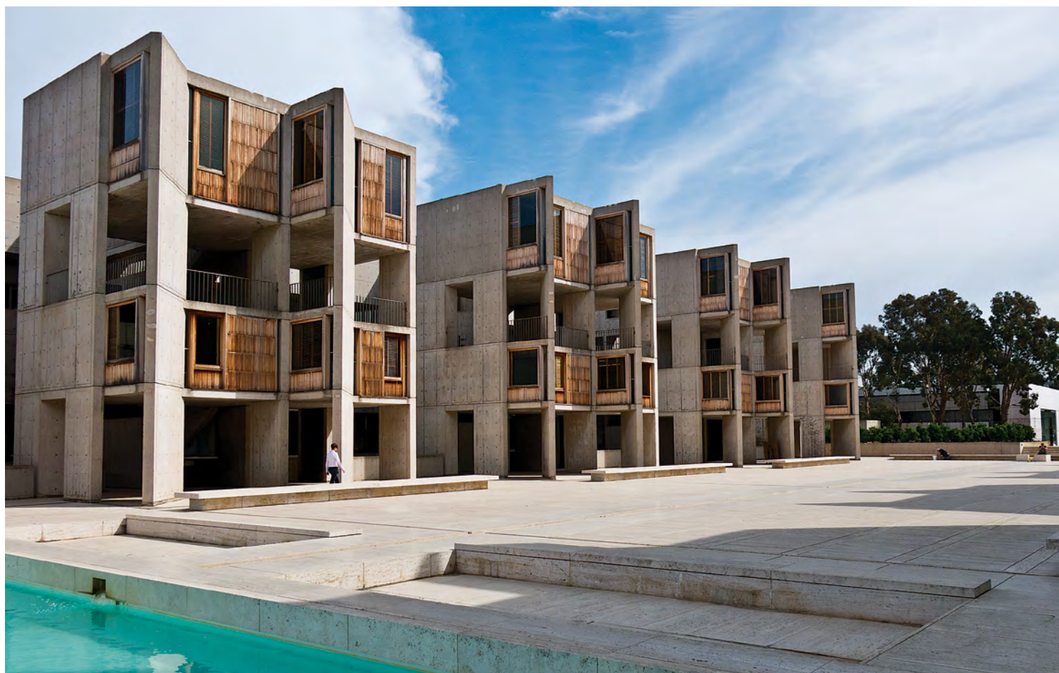
The Salk Institute in La Jolla, California, where the teakwood windows of this Louis Kahn building complex are the focus of a GCI project.

This second field project under the GCI’s Conserving Modern Architecture Initiative aims to address the aging and long-term care of the buildings’ teakwood fenestration windows, which are a major architectural element of the site.