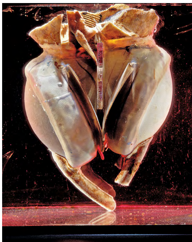
The Liotta–Cooley heart—the first artificial heart to be implanted in a human body. It included plastic components and kept the recipient alive for sixty-four hours until a human heart was available for transplant.

And now, with the proliferation of plastic pollution, the value of longevity is being questioned. Biodegradable and recyclable plastics that may help reduce our waste stream are engineered to fail. Biodegradable plastics are deliberately manufactured to be susceptible to heat, light, moisture, and microorganisms; recycled plastics are prone to weakness, increased oxidation and diversity in polymer weights, and contamination. As opposed to the desired stability of traditional artifact materials, here we may be moving toward enhanced instability, a property that will have interesting consequences for cultural heritage preservation. Some of these materials are already entering collections.