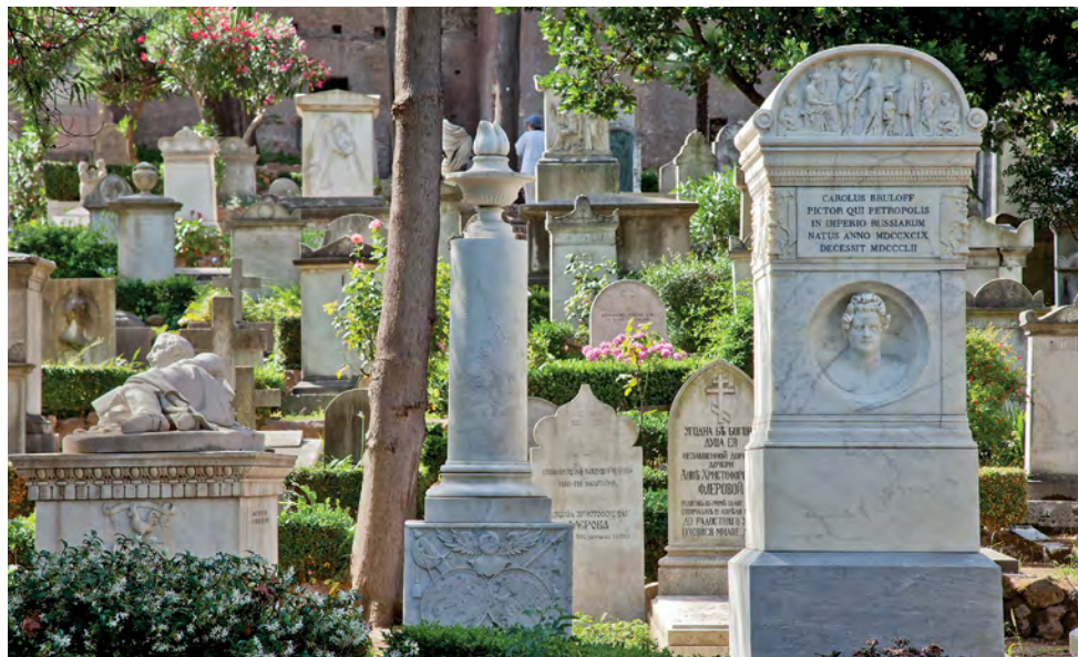
Rome's Non-Catholic Cemetery, where a fieldwork practicum of the 2015 international stone course will be held.

In 1988 he joined the GCI, first as head of the analytical section of Science. In later years, he served for a time as deputy head and acting head of Science. Early on, he was involved in a number of research areas, including binding media, environmental research, environmental