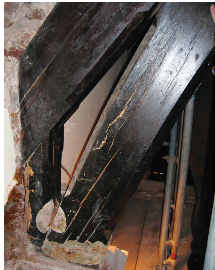
View of an arch-braced roof assembly. The brace and the post behind it suffer from fungal attack caused by water infiltration. Pentachlorophenol would have helped produce a fungus-free zone while the area dries after repairs, but this option is no longer available—a situation that leads to more removal of historic fabric.

First produced in the 1930s, pentachlorophenol (PCP), C_6Cl_5HO , is an organochlorine compound used in many industries as a pesticide, disinfectant, and fungicide. The chemical has been one of the most successful treatments against wood decay fungi in damp historic buildings. Compared to the more environmentally friendly fungicides, it is less water soluble and so sustains its fungicidal effect.