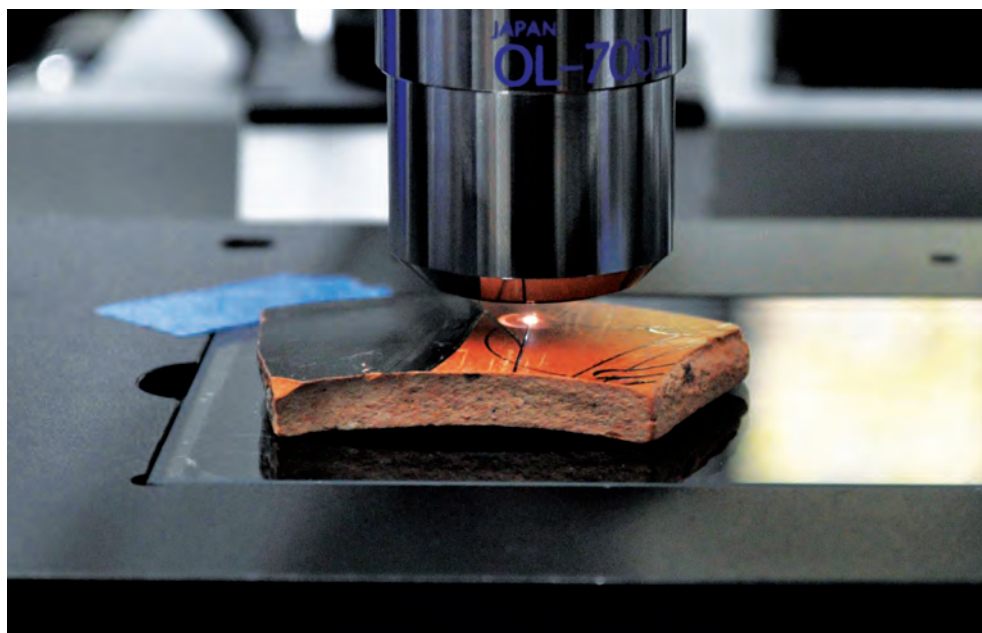
Scientific examination of a fragment of Attic pottery.

with investigations into the development of this technology within the context of ancient workshop practice will also be evaluated.