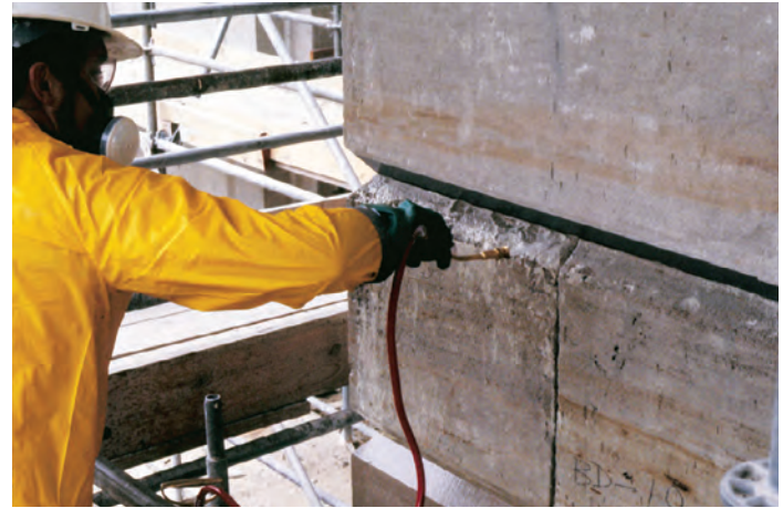
A technician applies PROSOCO's Conservare OH100 Consolidation Treatment to strengthen deteriorated sandstone at the U.S. Capitol. OH100 strengthens historic stone fabrics by replacing the stone's natural binding materials lost to time and weathering.

Despite obvious synergies, historic preservation and sustainability sometimes clash at the level of conservation treatments. But perceived conflicts all depend upon how sustainability is defined. In the three treatment cases cited, the use of potentially harmful materials has been justified for conservation purposes on the grounds that no substitutes replicate their effectiveness. The authentic maintenance and repair of historic buildings and the retention of original physical materials are justified (e.g., through the ICOMOS Nara Document on Authenticity, 1994) 1