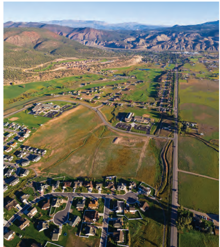
Urban sprawl encroaching on undeveloped land. Environmental and heritage conservation have viewed landscape conservation as common ground. With rising population size driving urban growth, landscape protection is becoming far more complex.

The bulk of sustainability research and policy making has focused on environmental sustainability, within which are two fundamental discourses: mitigation and adaptation. Mitigation focuses on minimizing climate change. Adaptation addresses the effects of climate change.