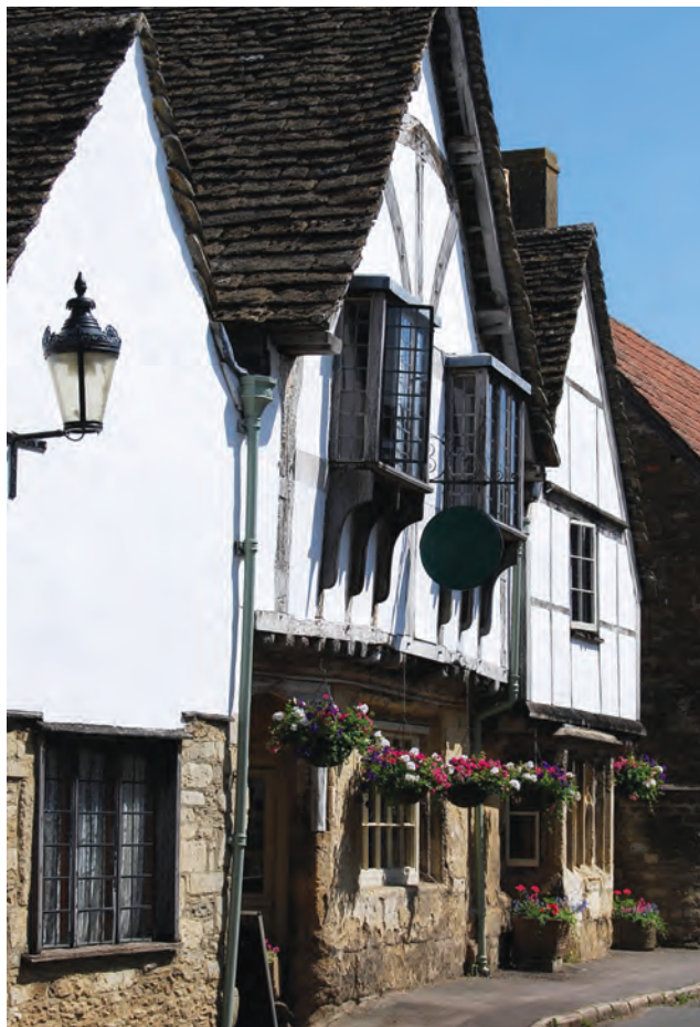
A half-timbered Tudor house in the village of Lacock, Wiltshire, England. Effective maintenance and repair of a historic building such as this—in a manner that retains original physical materials—often requires the use of potentially harmful materials.

lead paint use for works of art and historic buildings on the grounds that no other paints were compatible, or as durable, or had the same qualities of appearance; controlled specialist use could continue. The UK government allowed the manufacture and use of lead paint only for the restoration of Grade I and II