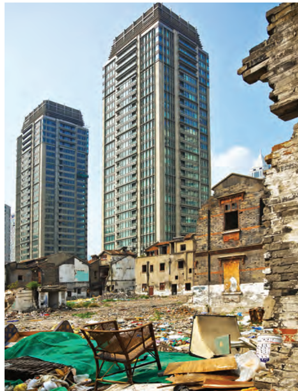
Modern construction replacing older structures in Shanghai, China. Construction, rehabilitation, and demolition debris constitutes nearly half of all the waste generated in higher-income countries.

The environmental and heritage conservation establishments have long viewed landscape conservation as common ground. The preservation of forests and open space enables the sequestration of carbon and the protection of ecosystems; the conservation of cultural landscapes can bolster that process. However, with rising population size and rural-to-urban migration driving increased urban growth around the world,