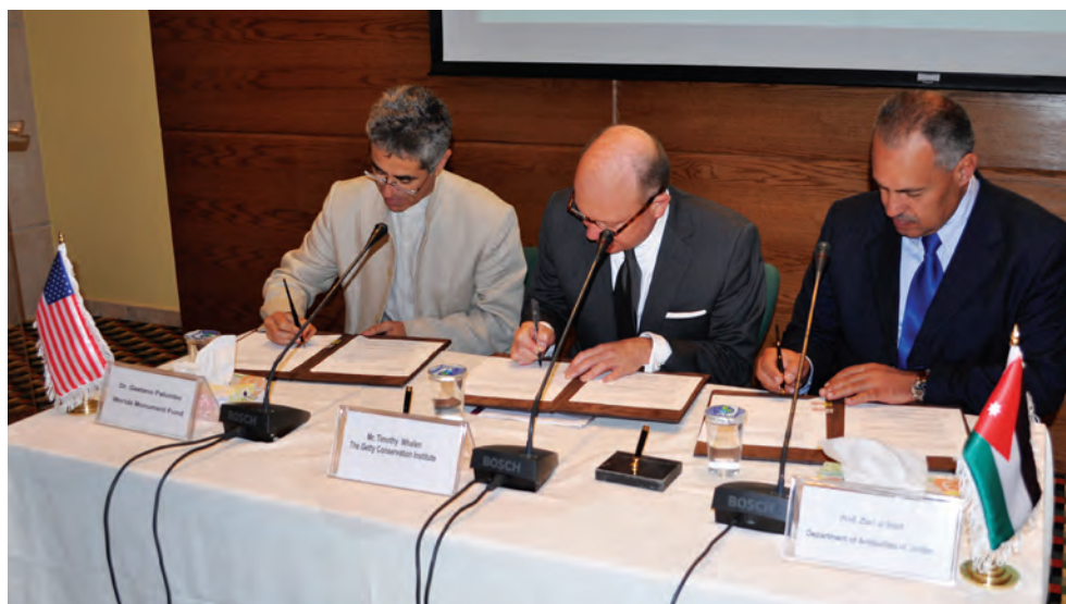
Signing of a new memorandum of understanding for MEGA-Jordan.

term use of the system, as well as ongoing work by the GCI and WMF to expand the system's functionality beyond archaeological sites so it may be used to manage other heritage types, such as historic buildings, architectural ensembles, and cultural landscapes and routes. The partners also discussed other potential activities for dissemination of MEGA in the broader Arab region.