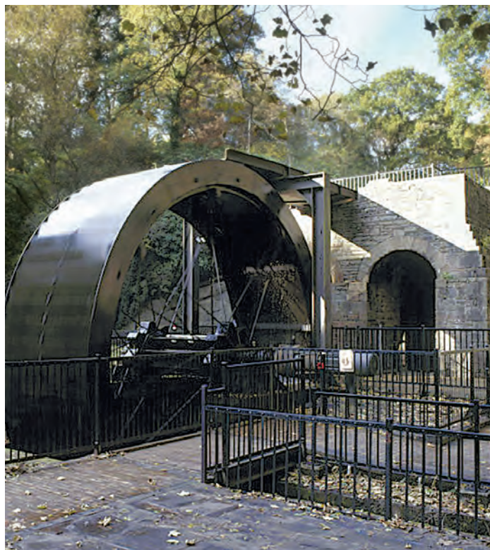
A restored nineteenth-century waterwheel provides hydroelectricity for the National Trust visitor facilities. Museums and other heritage sites should consider switching to renewable energy sources as part of capital expenditures.

As part of these principles, interim guidelines for environmental conditions have been proposed. For the majority of objects containing hygroscopic material, a stable RH is required in the range of 40 to 60 percent and a stable temperature in the range of 16°C to 25°C. More sensitive materials will require RH control that is tight and specific—specific according to the material. Less sensitive materials can have wider parameters for RH and temperature.