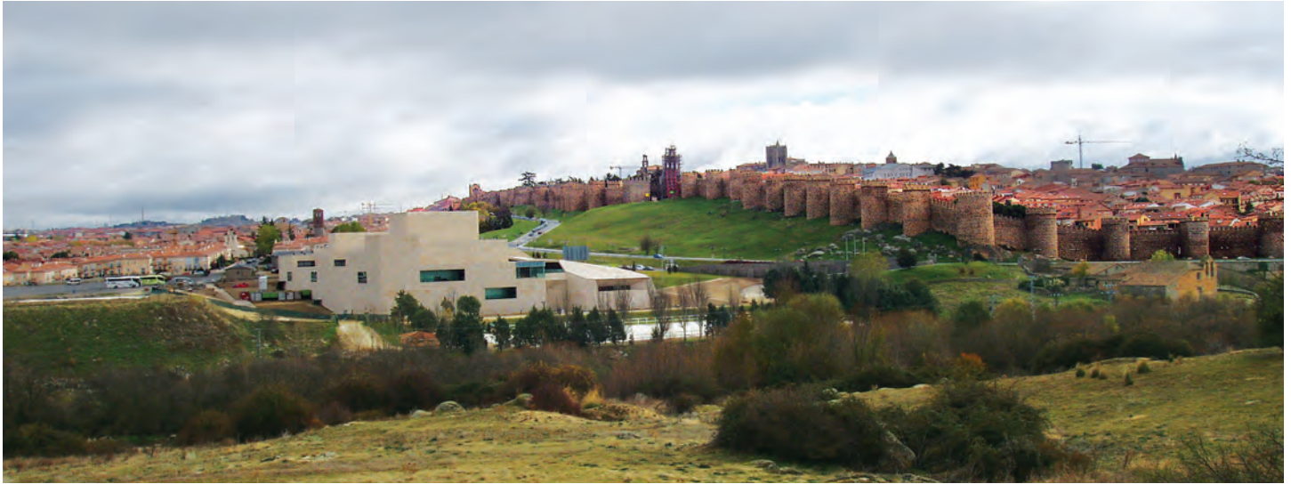
Development outside the historic walls of the World Heritage City of Avila, Spain. Densification of historic centers often runs counter to conservation goals, but decentralized development can destroy open space and create sprawl.

land use planning and landscape protection are becoming a far more complex endeavor. Sustainability concerns compel the need to curb suburban sprawl and to densify existing urban centers instead. Such densification, along with the infrastructure development that accompanies it, often runs counter to heritage aims in older, historic cities. As communities and metropolitan regions grapple with the need to develop more robust economies and greener built environments, difficult trade-offs must be made regarding the historic urban fabric.