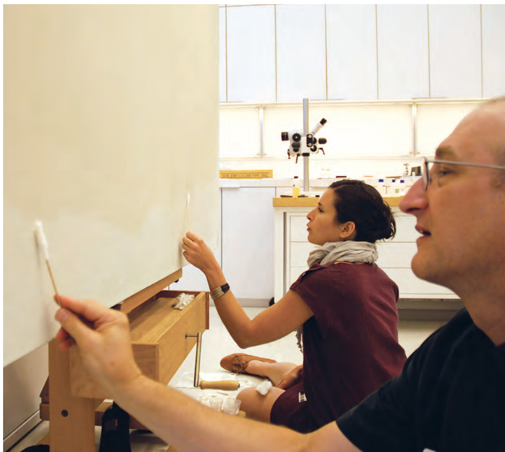
Cleaning of Doug Wheeler's Untitled (1964) in the GCI laboratories. Art: © 2011 Doug Wheeler.

Cleaning of Untitled (1964) was successfully completed, and the painting will be shown in Phenomenal: California Light and Space , opening in October 2011 at the Museum of Contemporary Art San Diego. This exhibition is part of the Getty initiative Pacific Standard Time: Art in L.A. 1945–1980. Pacific Standard Time will also feature the GCI-organized exhibition Start