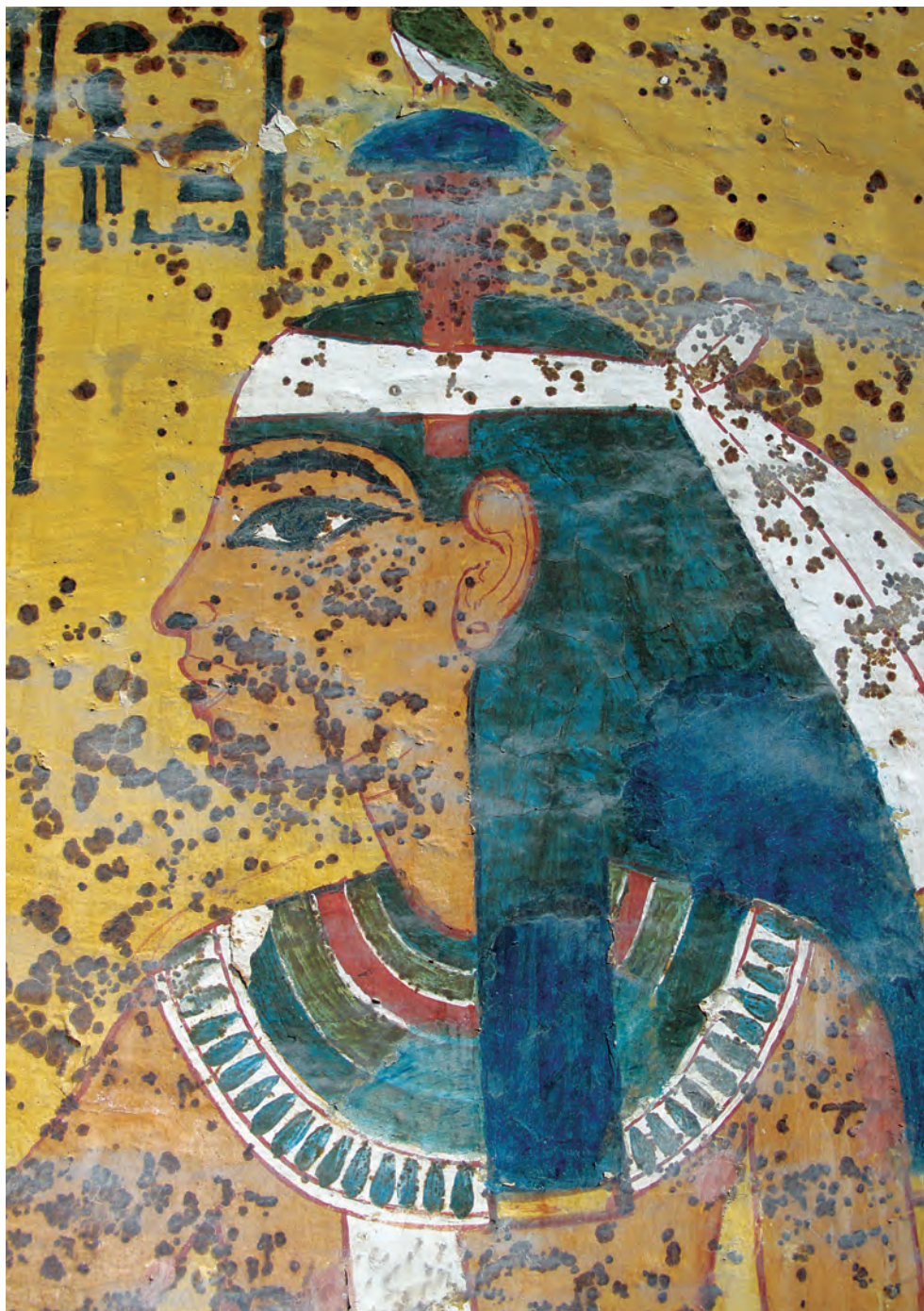
Detail of a wall painting with brown spots in the tomb of Tutankhamen.