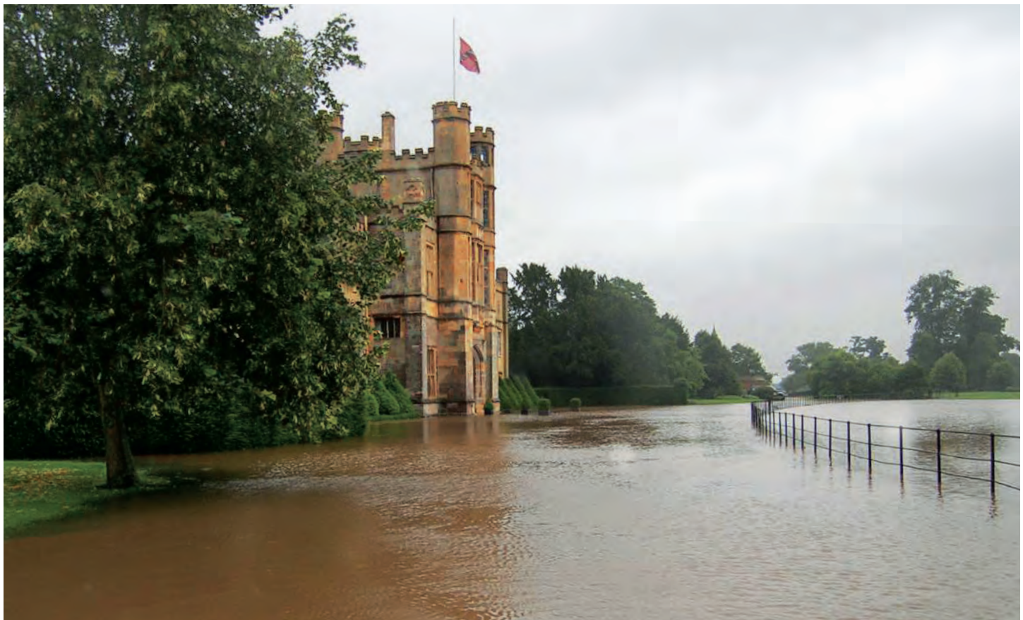
A view of an inundated Coughton Court during July 2007 flooding caused by a one-in-two-hundred-year storm.