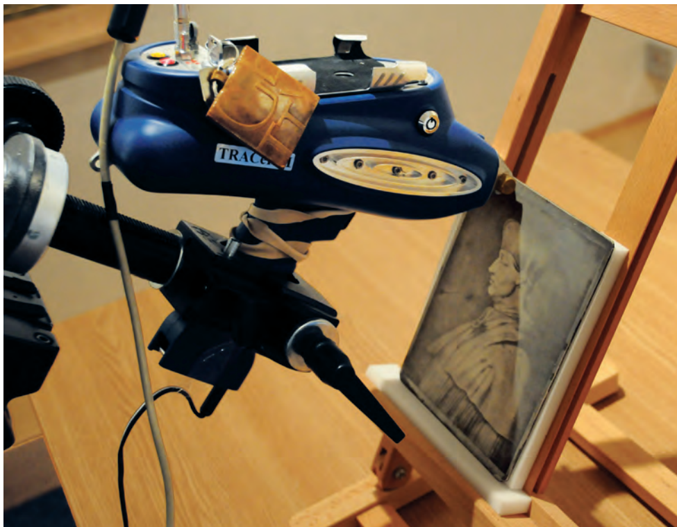
XRF analysis performed on the Cardinal d'Amboise plate by Niépce, from the Royal Photographic Society collection at the National Media Museum.

During the visit, the partners discussed maintenance of the system over the next two years and other measures to support the long-