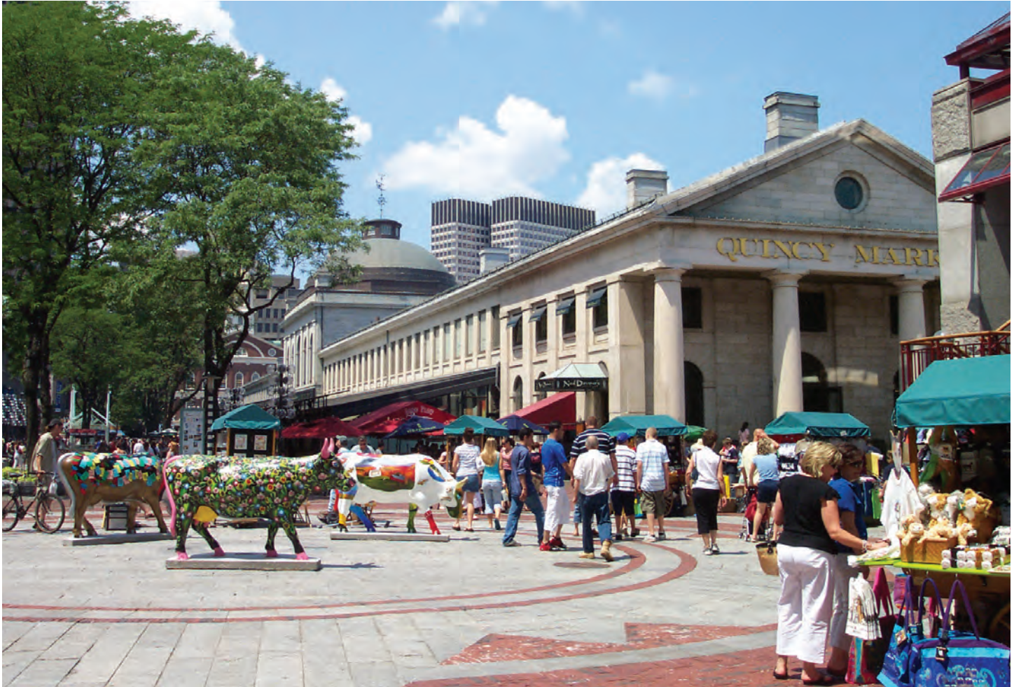
Quincy Market, part of the Faneuil Hall Marketplace in Boston. This 1970s rehabilitation of 19th-century buildings was the first historic preservation project to be honored by the American Institute of Architects with its Twenty Five Year Award—honored for its visionary redesign and its compatibility with sustainability principles. Photo: © Chris Wood. Licensed under the Creative Commons Attribution-Share Alike License.