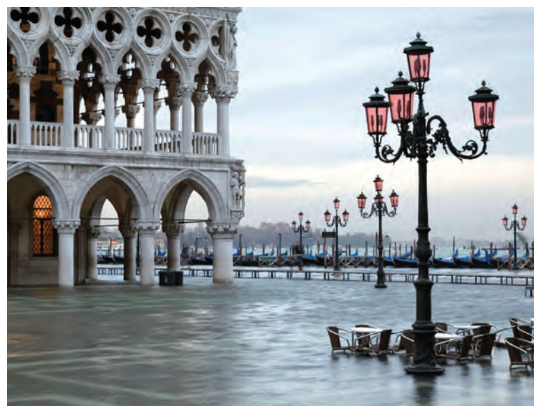
Flooding in St. Mark's Square, Venice. Rising sea levels—a result of global warming—threaten this World Heritage site.

The first and most significant research project has been Noah's Ark: Global Climate Change Impact on Built Heritage and Cultural Landscapes . 2 The project, undertaken by a consortium of European institutions, produced predictions of the impact of climate and pollution on cultural heritage by investigating the response of historic materials and structures to future climate scenarios for Europe. The research has also helped to improve practice by developing and utilizing heat and moisture movement computer models to examine the effect of climate change on built cultural heritage; by validating model predic-