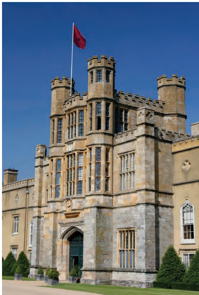
Historic house Coughton Court in Warwickshire, England.

There are many ways to reduce energy use in museums, and there are also opportunities to generate energy on-site by micro-