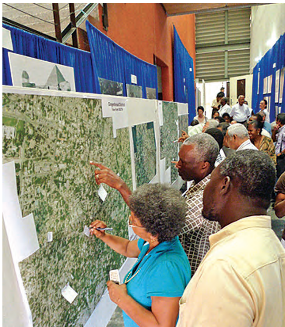
Owners of historic homes in Haiti mark their earthquake-damaged houses on image maps at a community meeting to advance repair efforts. Heritage conservation serves as an important tool for reinforcing collective identity and ensuring social continuity and sustainability in disaster recovery efforts.