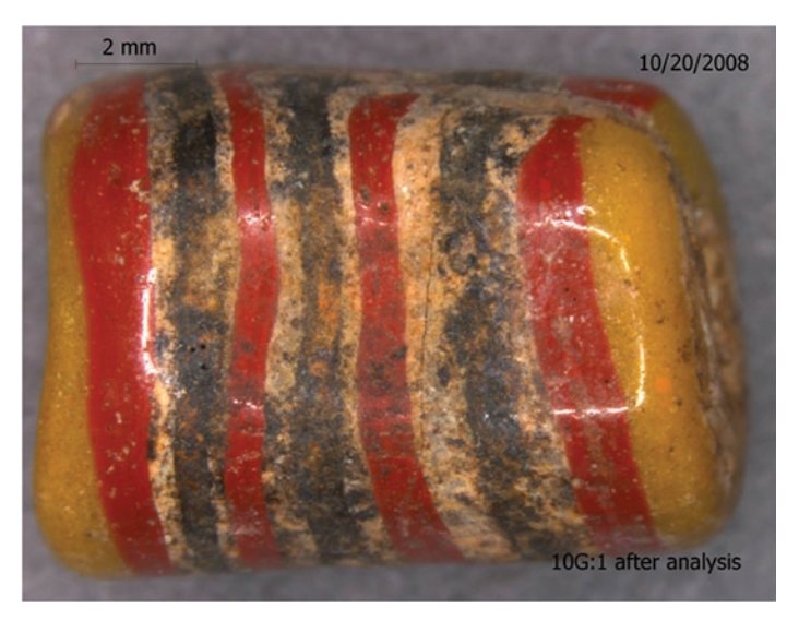
Multicolor Sassanian-period glass bead from Nuzi.

Analysis showed that this well-preserved glass was extremely unusual for the late Bronze Age. All of the glasses exhibited higher aluminum levels than normally seen in glasses from this period and also showed the presence of lead-tin yellow colorant that was not used in glass until the Roman period (second to third centuries CE). Isotopic data from a single multicolored bead also confirmed that the strontium and neodymium