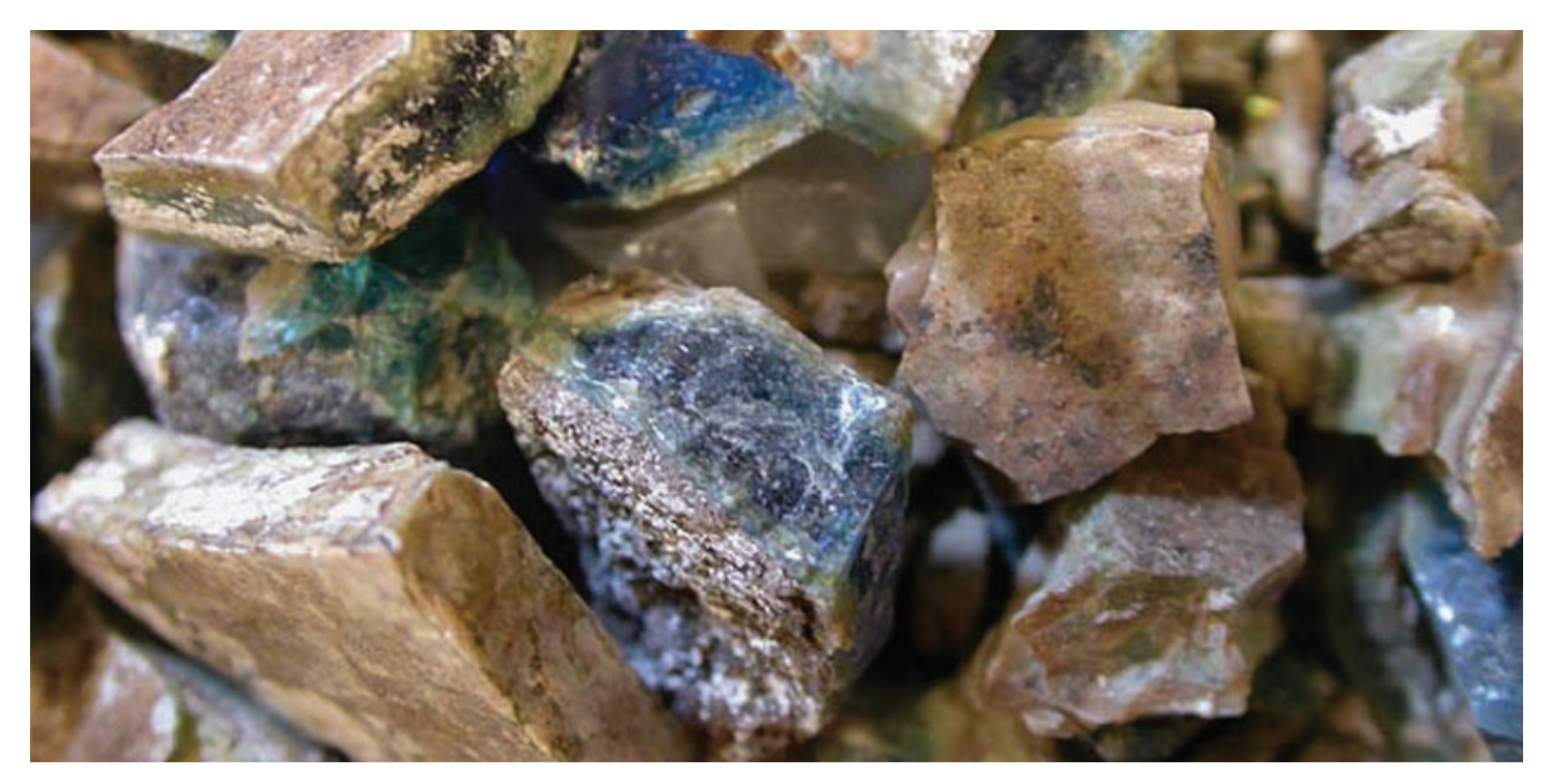
Fragments of glass, produced during Kassite rule in Babylonia, now in the University of Pennsylvania Museum collection.

Late Bronze Age glasses were prestige materials similar in value to semiprecious stones such as lapis lazuli and turquoise.