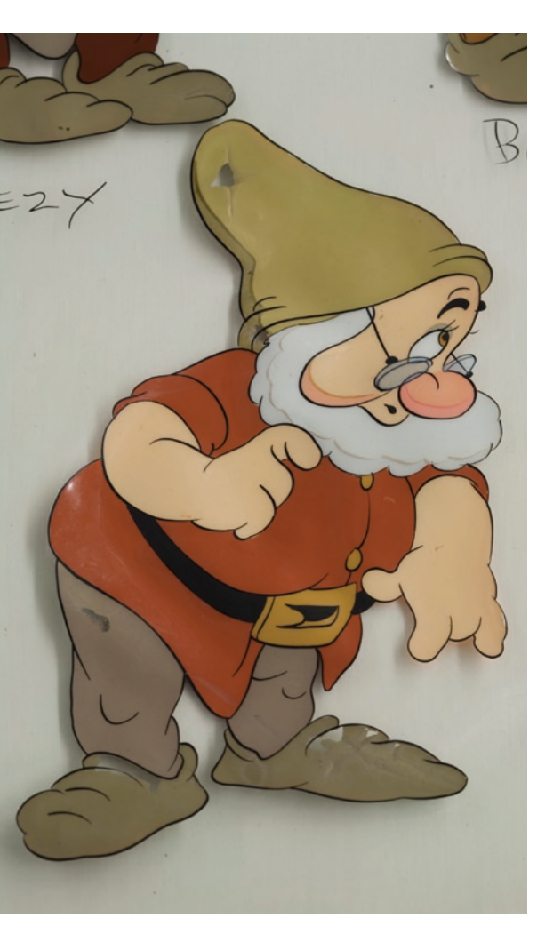
Detail of an animation cel from the 1937 film Snow White and the Seven Dwarfs, exhibiting signs of cellulose plastic deterioration and paint loss.