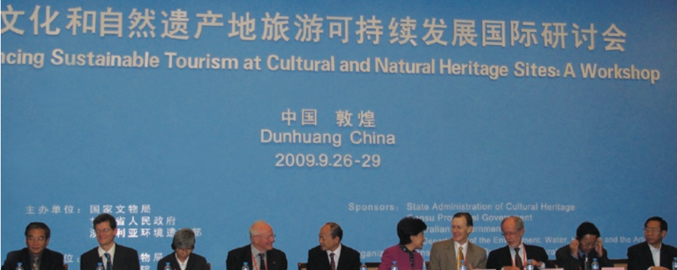
Opening of the workshop "Advancing Sustainable Tourism at Cultural and Natural Heritage Sites" at the Mogao Grottoes.

The GCI will continue working with the DA in the area of visitor management and site