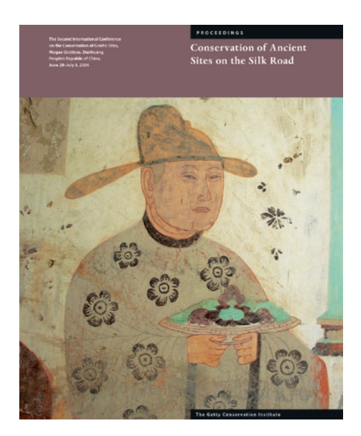
Conservation of Ancient Sites on the Silk Road: Proceedings from the Second International Conference on the Conservation of Grotto Sites Edited by Neville Agnew

The Mogao Grottoes are located along the ancient caravan routes—collectively known as the Silk Road—that once linked China with the West. Founded by Buddhist monks in the late fourth century, Mogao grew gradually over the following millennium, as monks, local rulers, and travelers carved hundreds of cave temples into a mile-long rock cliff and adorned them with vibrant murals portraying Buddhist scripture, Silk Road rulers, and detailed scenes of everyday life.