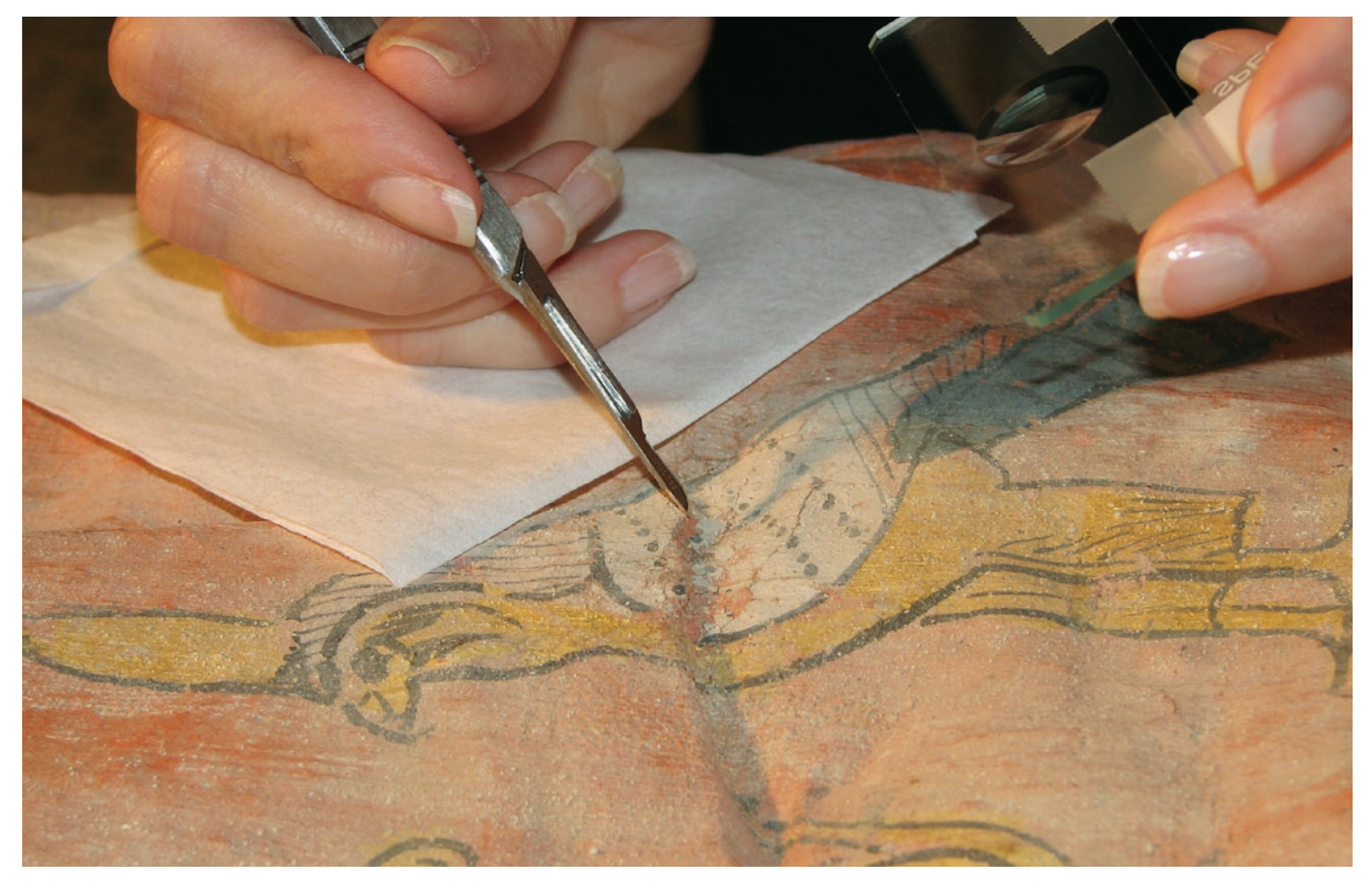
A small sample being removed from the Getty Museum's red shroud mummy Herakleides for a study into the composition of the red pigment.

bismuth black. While interesting, the significance of this finding was unclear until the study was expanded to include works spanning the course of Bourdichon's career. This expanded study provided insight into the development of his palette and technique, identifying Bourdichon as one of the earliest artists to employ bismuth black as a painting pigment.<sup>1</sup> Expansion of the study set to include related objects from other time periods or geographic locations might enable even broader questions to be addressed, such as how the pigment subsequently migrated to Italy, where it has been identified in early sixteenth-century panel paintings by Raphael and Fra Bartolommeo.<sup>2</sup>