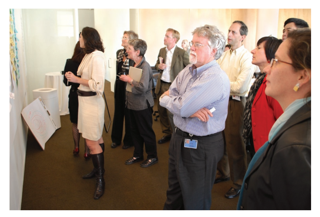
Workshop participants prioritize recommendations for promoting the application of consensus building methods to the practice of heritage management.

For more information on the Heritage Values, Stakeholders, and Consensus Building project, visit the GCI Web site at www.getty.edu/ conservation/field_projects/heritage/.