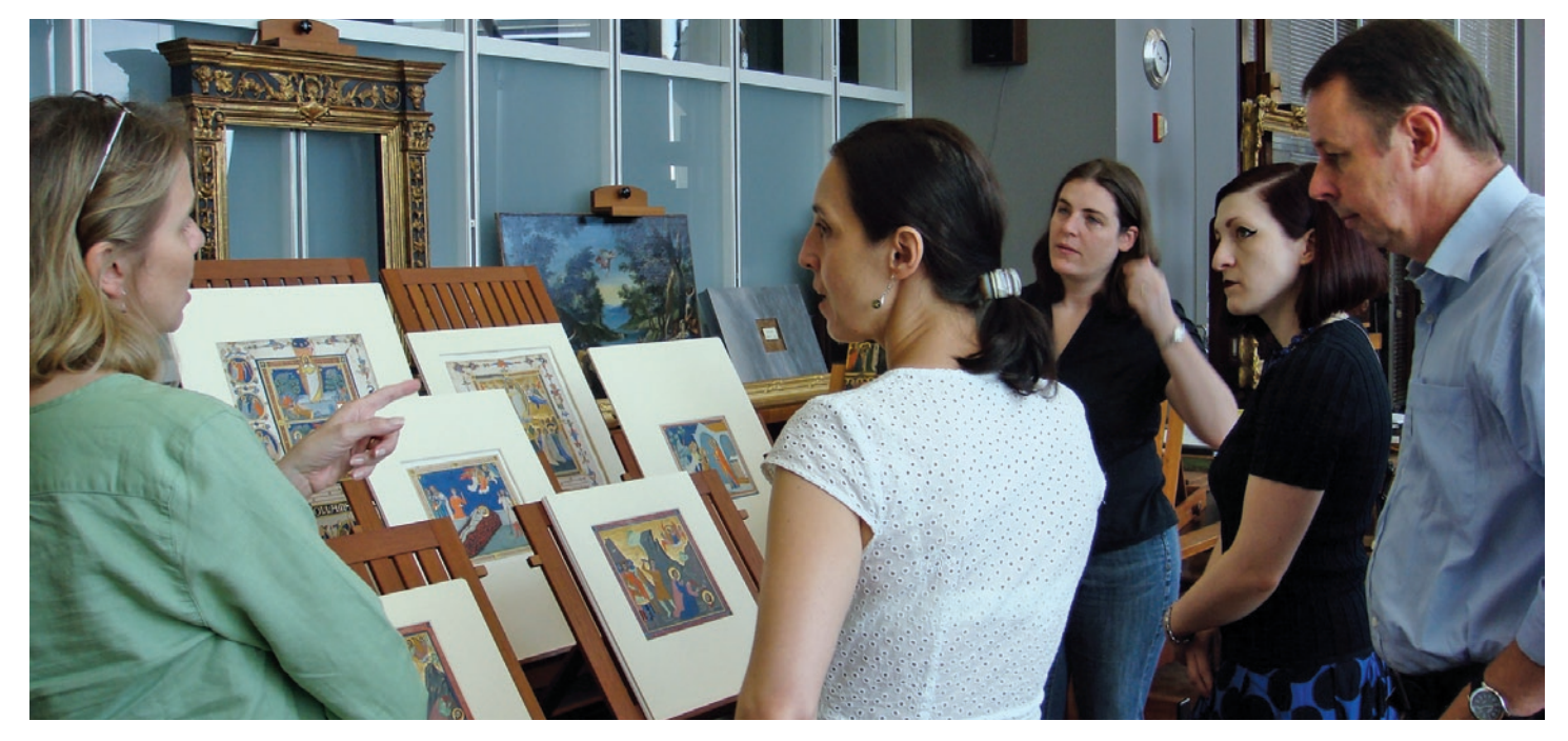
Group study day of Laudario leaves from the collections of the Getty Museum, the Fitzwilliam Museum, and Queens' College, Cambridge, held in the Getty Museum painting conservation studio.

One focus of the exhibition research is Pacino, a prolific manuscript illuminator and panel painter who produced altarpieces and private devotional paintings, as well as luxury copies of manuscripts, which fed the devotional and intellectual demands of his Florentine patrons. A detailed technical analysis of manuscript leaves and panel paintings from Pacino's workshop is under way; this research seeks to elucidate the artist's technique, the effects of material choices on the appearance and aging of his works, and elements of fourteenth-century Florentine workshop practice. For example, did the artist translate traditional illumination techniques into his work on panel, and vice versa? The appearance of many early panel paintings has changed over time because of environmental conditions and restoration; manuscripts, which often maintain their original appearance, may thus reveal important information about the intended appearance of early paintings, influencing both our understanding of these objects and their conservation.