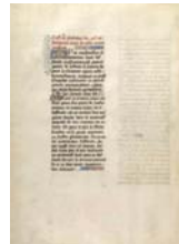
16. Unknown Text Page, about 1470 - 1475 from Book of the Deeds of Alexander the Great Tempera colors, gold leaf, gold paint, and ink on parchment Leaf: 43.2 x 33 cm (17 x 13 in.) The J. Paul Getty Museum, Los Angeles Ms. Ludwig XV 8, fol. 225v (83.MR.178.225v)