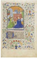
11. Willem Vrelant Flemish, died 1481, active 1454 - 1481 The Annunciation, early 1460s from Arenberg Hours Tempera colors, gold leaf, and ink on parchment Leaf: 25.6 x 17.3 cm (10 1/16 x 6 13/16 in.) The J. Paul Getty Museum, Los Angeles Ms. Ludwig IX 8, fol. 58 (83.ML.104.58)