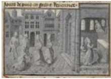
13. Lieven van Lathem Flemish, about 1430 - 1493, active 1454 - 1493 The Miracle of the Adulterous Woman's Repentance, about 1460 Miniature from Miracles of Our Lady Tempera colors and gold paint on parchment Leaf: 13.2 x 17.8 cm (5 3/16 x 7 in.) The J. Paul Getty Museum, Los Angeles Ms. 103, recto (2009.41.recto)