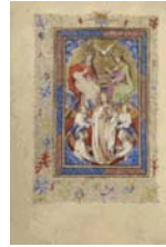
12. Unknown The Coronation of the Virgin by the Trinity, after 1460 from Book of Hours Tempera colors, gold leaf, and ink on parchment Leaf: 17.1 x 12.2 cm (6 3/4 x 4 13/16 in.) The J. Paul Getty Museum, Los Angeles Ms. Ludwig IX 9, fol. 15v (83.ML.105.15v)