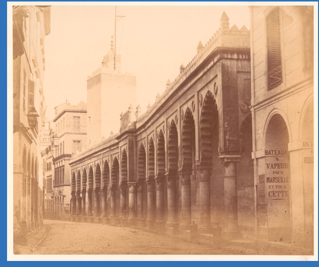
Cover Image & Fig. 1 Charles Marville, Rue de la Marine, 1850s.

French rule transformed Algeria. European norms and the French system of governance were imposed. The land was mapped, its peoples surveyed and classified, and dramatic interventions to urban fabrics enforced a new duality. In Algiers, the "Arab" city on the hillside, known as the Casbah, was separated from the "French" or European city that spread out in districts below and around the Casbah. This division, engraved into the spaces of Algiers, endured during the 132 years of French rule that ended with the War of Independence (1954–1962).