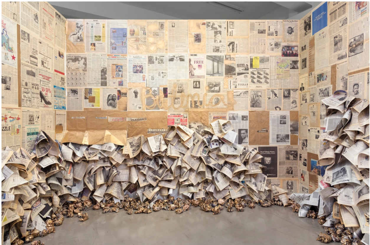
Senga Nengudi, Bulemia , 1988/2018 (detail). Newspaper and gold spray paint. 121 ¼ x 167 x 169 inches. © Senga Nengudi. Installation view, Sprüth Magers, Los Angeles, 2020.