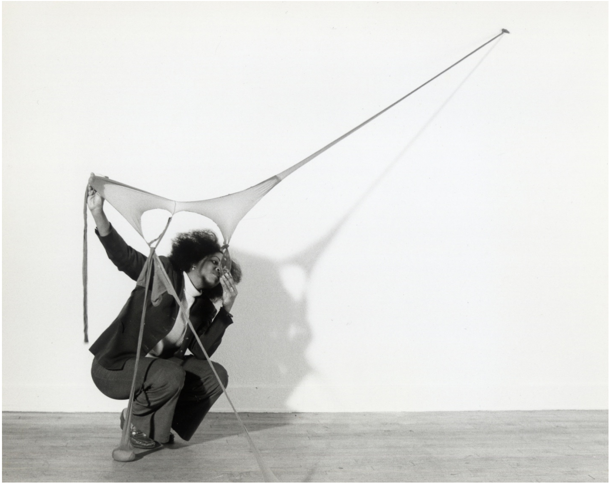
Senga Nengudi setting up for a performance with R.S.V.P. X , 1976. Senga Nengudi Papers, Amistad Research Center, New Orleans. © Senga Nengudi.