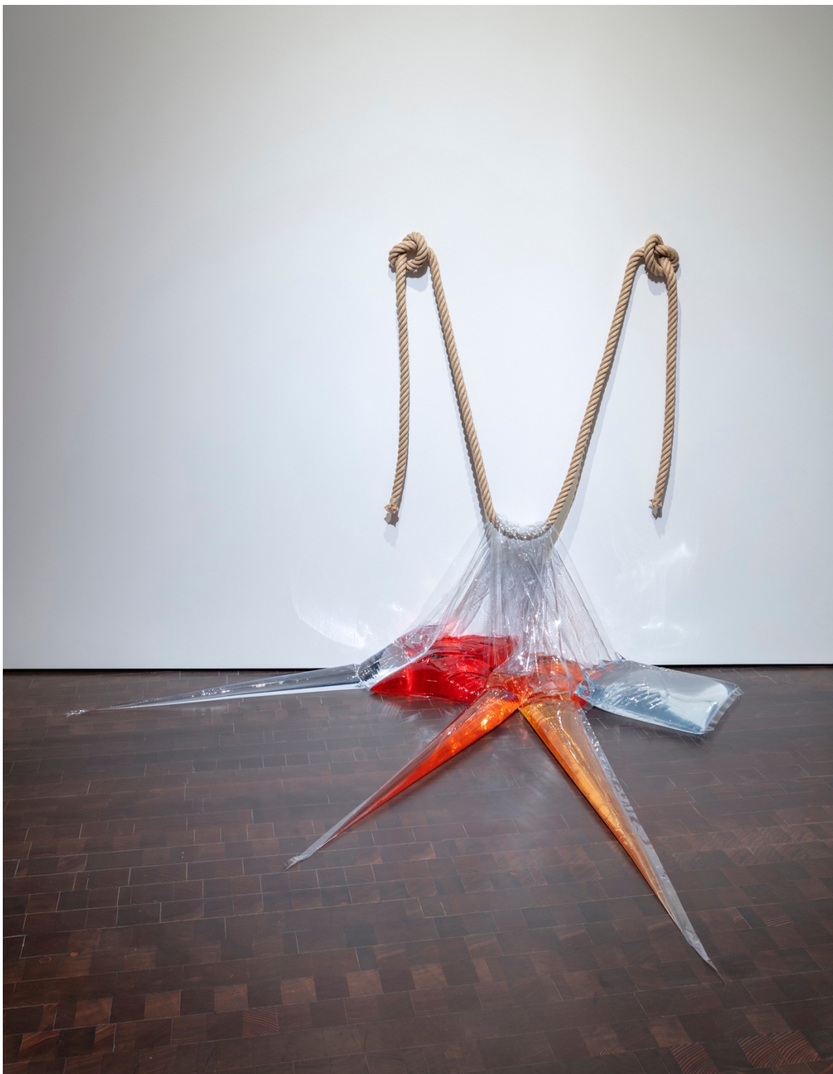
Senga Nengudi, Water Composition I , 1969–70/2019. Heat sealed vinyl, coloured water 147.3 x 203.2 x 180.3 cm. 58 x 80 x 71 inches. © Senga Nengudi.