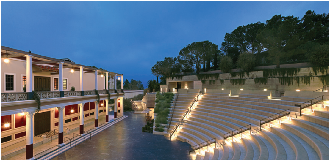
View of the Barbara and Lawrence Fleischman Theater and the entrance of the J. Paul Getty Museum at the Getty Villa

Tonight's performance is approximately ninety minutes long, without intermission.