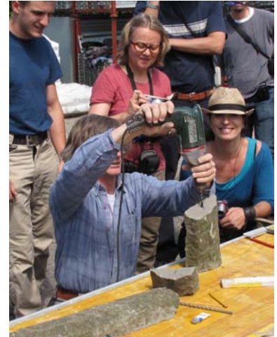
Figure 1 Demonstration of pinning techniques. Parma, Italy, 2013.