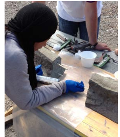
Figure 2 Participants pinning a stone lintel. Parma, Italy, 2013.