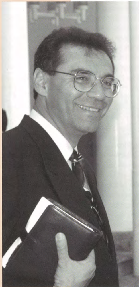
Dr. Jamil Mahuad Witt, Mayor of Quito.