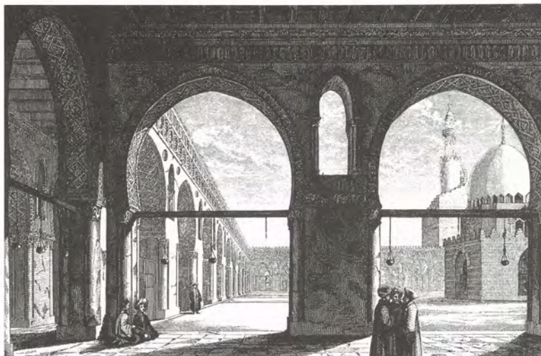
Above: Nineteenth century illustration of the Mosque of Ebn Touloun in Cairo.