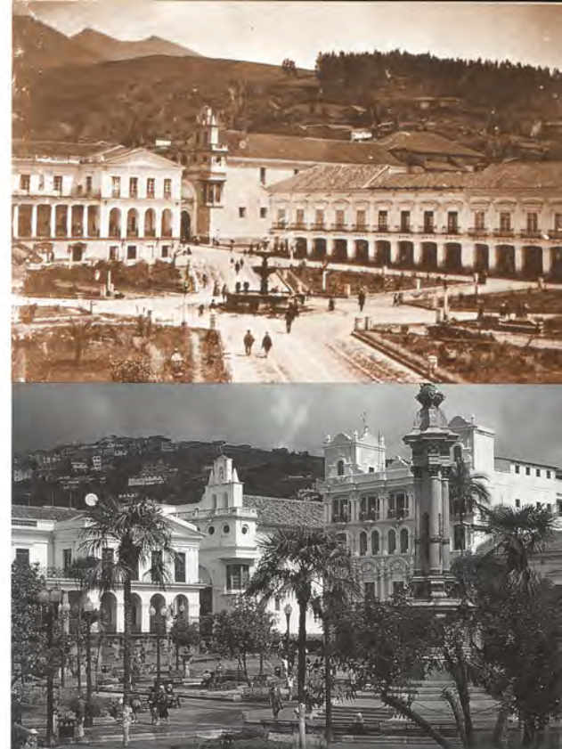
Facing page: Overview of Quito's historic center. Photo: Guillermo Aldana. Inset: Traffic on García Moreno Street. Photo: Jesús Lopez. Above top: Historic photo of Plaza Grande. Rephotographed by: Guillermo Aldana. Below: Plaza Grande today. Photo: Guillermo Aldana.

The mayor's office is also developing strategies to better communicate its mission to the public. Recently, a series of television programs were produced to generate local awareness and interest in historic preservation, and a variety of educational and advocacy activities are planned to encourage broader