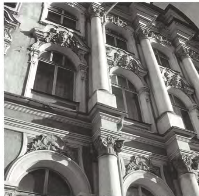
Above: The Hermitage Museum.

For over four years, the Institute has provided technical assistance to the Russian Academy of Sciences Library's preventive conservation program, the first of its kind in Russia, established in collaboration with the U.S. Library of Congress after the 1988 fire that devastated BAN's collections. BAN's preventive conservation program was showcased at the conference.