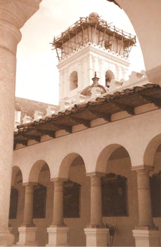
Facing page: Façade of La Compañía de Jesús. Photo: Guillermo Aldana. Left: Courtyard and bell tower of La Merced. Photo: Neville Agnew. Right: Colloquium participants examine seismic damage. Photo: Neville Agnew.

monuments, and its artistic, cultural, and historical value is widely recognized throughout the world. Because the plan for stabilization includes the use of exposed tensors (rigid steel cables that provide strengthening), there was much discussion regarding