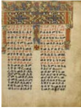
23. Unknown Saint Mark, about 1504-5 from Gospel Book Tempera on parchment Leaf: 34.5 x 26.5 cm (13 9/16 x 10 7/16 in.) The J. Paul Getty Museum, Los Angeles Ms. 102, fol. 27 (2008.15.27)