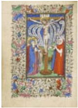
19. Master of Sir John Fastolf French, active before about 1420 - about 1450 The Seven Last Words of Christ, about 1430-40 from Book of Hours Tempera colors, gold leaf, and ink on parchment Leaf: 12.1 x 9.2 cm (4 3/4 x 3 5/8 in.) The J. Paul Getty Museum, Los Angeles Ms. 5, fol. 16v (84.ML.723.16v)