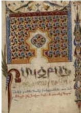
27. Unknown Decorated Incipit Page, 1615 from Gospel Book Tempera colors, gold paint, and gold leaf on glazed paper Leaf: 23 x 17.1 cm (9 1/16 x 6 3/4 in.) The J. Paul Getty Museum, Los Angeles Ms. Ludwig II 7, fol. 194 (83.MB.71.194)