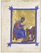
17. Unknown Saint Mark , about 1325-45 Leaf from a Gospel Book or New Testament Tempera colors and gold leaf on parchment Leaf: 19.2 x 14.5 cm (7 9/16 x 5 11/16 in.) The J. Paul Getty Museum, Los Angeles Ms. 70, verso (2002.23.verso)