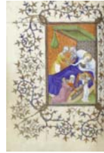
18. Pseudo-Jacquemart de Hesdin French, active about 1380 - 1415 The Birth of the Virgin , about 1410 from Collection of Masses for High Feasts Tempera colors, gold leaf, gold paint, and ink on parchment Leaf: 17.9 x 13.3 cm (7 1/16 x 5 1/4 in.) The J. Paul Getty Museum, Los Angeles Ms. 36, fol. 71v (89.ML.3.71v)