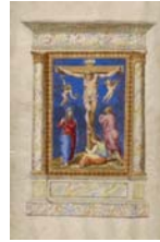
24. Fra Vicentius a Fundis Crucifixion, 1567 from Missal of Bishop Antonio Scarampi Tempera and gold leaf on parchment Leaf: 41 x 27 cm (16 1/8 x 10 5/8 in.) The J. Paul Getty Museum, Los Angeles Ms. Ludwig V 7, fol. 11v (83.MG.82.11v)