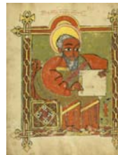
22. Unknown Saint Matthew , about 1504-5 from Gospel Book Tempera on parchment Leaf: 34.5 x 26.5 cm (13 9/16 x 10 7/16 in.) The J. Paul Getty Museum, Los Angeles Ms. 102, fol. 26v (2008.15.26v)