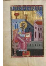
28. Malnazar and Aghap'ir Saint Matthew, 1637-38 from Bible Tempera colors, gold paint, and gold leaf on parchment Leaf: 25.2 x 18.3 cm (9 15/16 x 7 3/16 in.) The J. Paul Getty Museum, Los Angeles Ms. Ludwig I 14, fol. 495v (83.MA.63.495v)