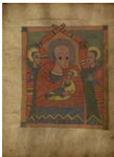
21. Unknown Virgin and Child, about 1480 - 1520 from Gospel Book Tempera on parchment Leaf: 34.5 x 25.6 cm (13 9/16 x 10 1/16 in.) The J. Paul Getty Museum, Los Angeles Ms. 105, fol. 10 (2010.17.10)