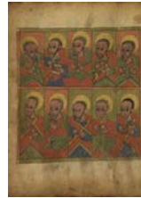
20. Unknown The Prophets, Apostles, and Disciples, about 1480 - 1520 from Gospel Book Tempera on parchment Leaf: 34.5 x 25.6 cm (13 9/16 x 10 1/16 in.) The J. Paul Getty Museum, Los Angeles Ms. 105, fol. 9v (2010.17.9v)