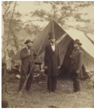
13. Alexander Gardner American, born Scotland, 1821 - 1882 President Lincoln, United States Headquarters, Army of the Potomac, near Antietam, October 4, 1862 Albumen silver print Image: 21.9 x 19.7 cm (8 5/8 x 7 3/4 in.)