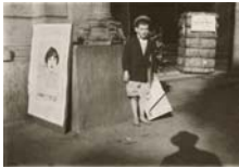
37. Lewis W. Hine American, 1874 - 1940 [Newsboy, Mobile, Alabama] , October 1914 Gelatin silver print Image: 11.8 x 16.8 cm (4 5/8 x 6 5/8 in.) The J. Paul Getty Museum, Los Angeles 84.XM.132.33