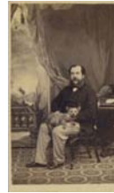
28. Conway Weston Hart British, active 1860s [Man with Mustache and Muttonchops, seated with a dog on his lap], 1870s Albumen silver Image: 9.4 x 5.9 cm (3 11/16 x 2 5/16 in.) The J. Paul Getty Museum, Los Angeles 84.XD.1426.47