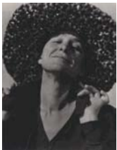
39. Alfred Stieglitz American, 1864 - 1946 Georgia O'Keeffe: A Portrait, Negative 1919; Printed 1920s Gelatin silver print Image: 11.7 x 8.9 cm (4 5/8 x 3 1/2 in.) The J. Paul Getty Museum, Los Angeles 93.XM.25.78