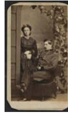
12. Charles DeForest Fredricks American, 1823 - 1894 [General George Brinton McClellan and his wife], 1862 Albumen silver Image: 9 x 5.4 cm (3 9/16 x 2 1/8 in.) The J. Paul Getty Museum, Los Angeles 84.XD.1157.100