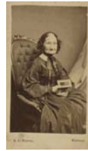
26. Henry F. Warren American, active 1860s - 1870s [Elderly woman holding a photograph], about 1865 Albumen silver Image: 9 x 5.4 cm (3 9/16 x 2 1/8 in.) The J. Paul Getty Museum, Los Angeles 84.XD.1157.699