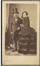
27. André Adolphe-Eugène Disdéri French, 1819 - 1889 Napoleon III et Eugenie, about 1870 Albumen silver Image: 8.5 x 5.2 cm (3 3/8 x 2 1/16 in.) The J. Paul Getty Museum, Los Angeles 84.XD.378.8