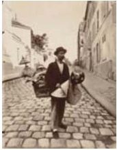
35. Eugène Atget French, 1857 - 1927 Lampshade Vendor, rue Lepic, Paris , 1901 Albumen silver print Image: 22.2 x 17.8 cm (8 3/4 x 7 in.) Anonymous gift. The J. Paul Getty Museum, Los Angeles 94.XM.108.4